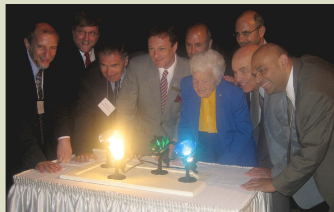
Mayor Hazel McCallion and R.I.C. Centre partners at the centre's launch

Mayor McCallion and EDO staff attended the official launch of the R.I.C. Centre, formerly known as the Western Greater Toronto Area Commercialization Centre. The R.I.C. Centre is a partnership of the University of Toronto Mississauga, Ministry