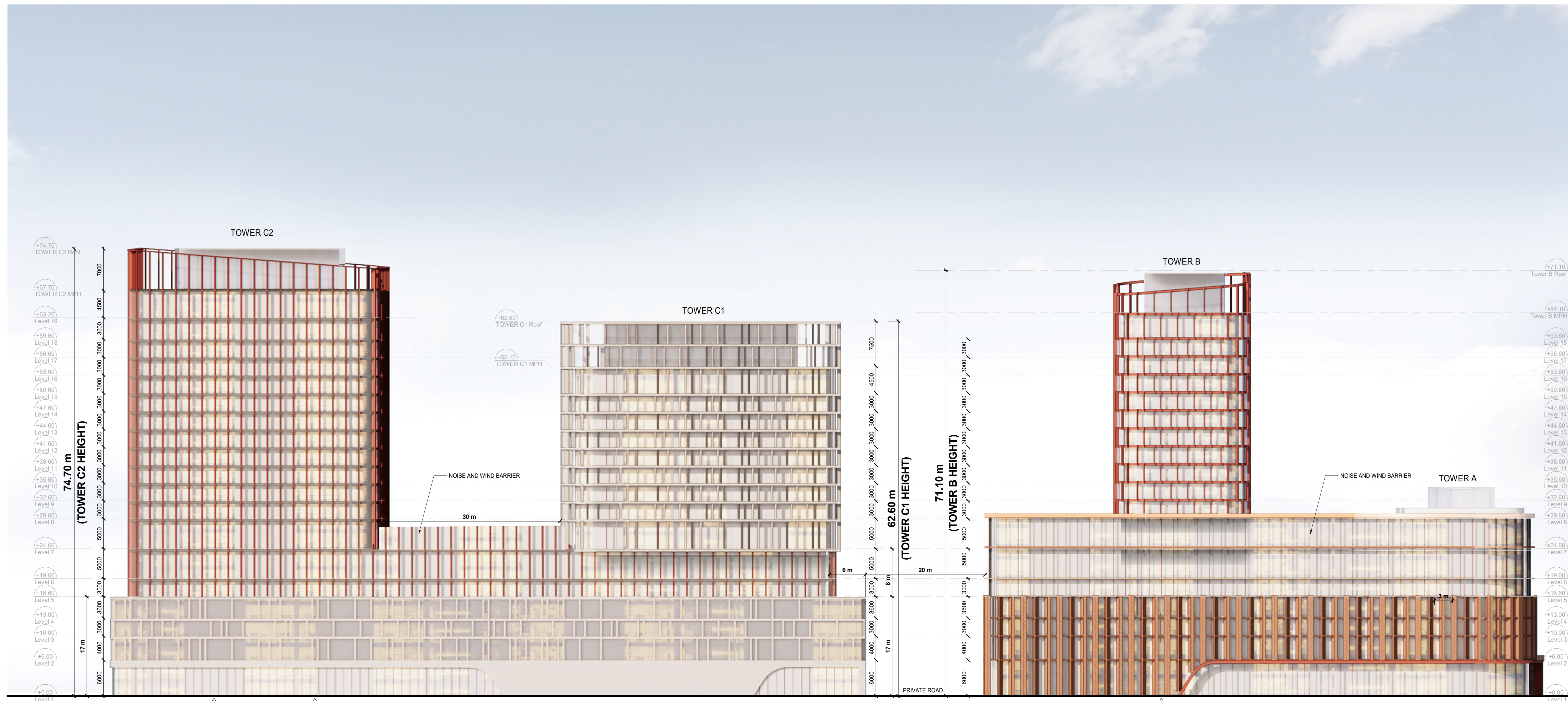
1 NORTH ELEVATION A302 1: 350

All drawings, specifications, related documents and design are the copyright property of the architect and must be returned upon request. Reproduction of the drawings, specifications, related documents and design in whole or in part is strictly forbidden without the architect's written permission.