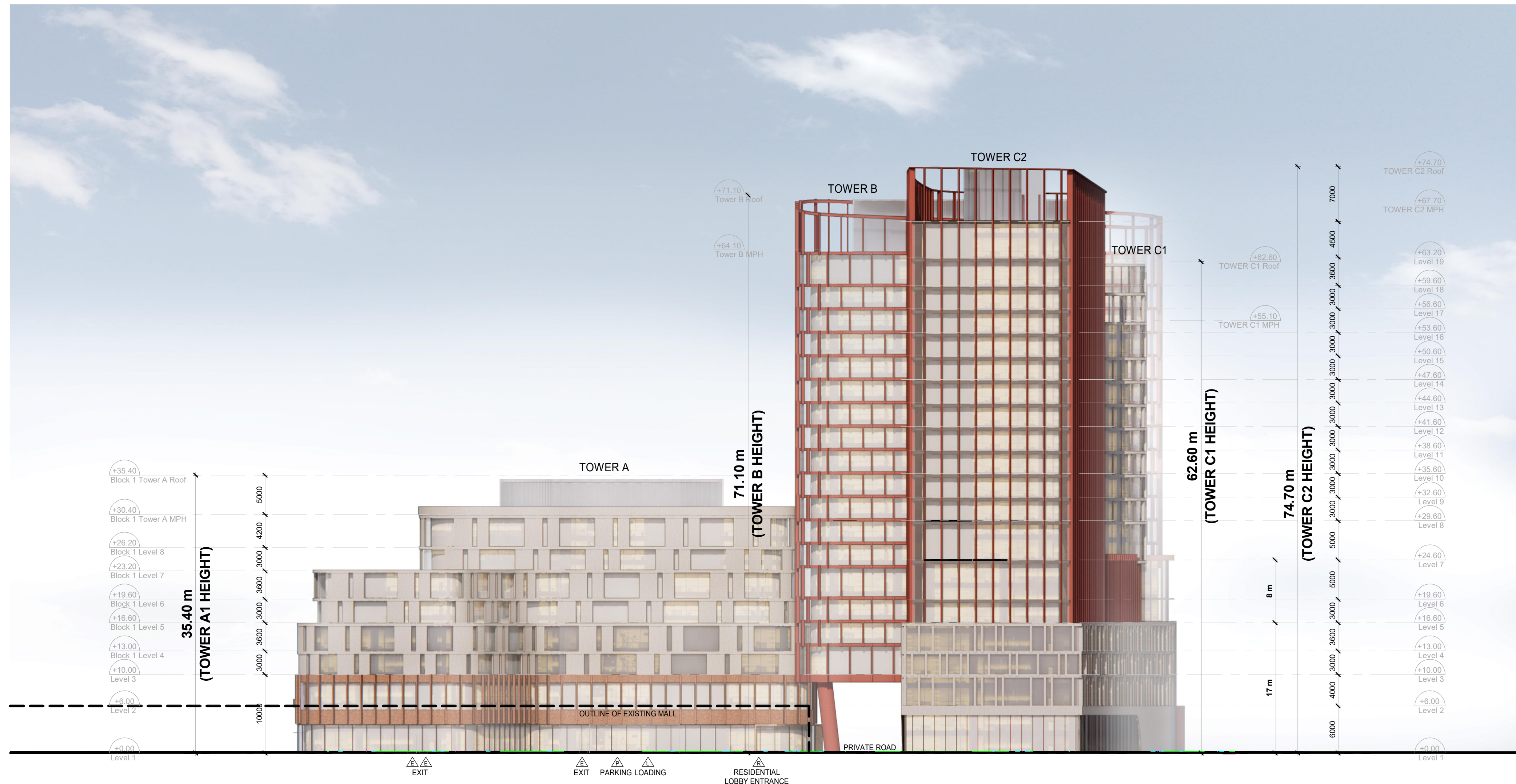
1 EAST ELEVATION A304 1 : 350