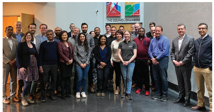
MCLP participants celebrate completion of the program

For more information about MCLP and to express your interest in participating in future program offerings, visit investmississauga.ca/climate-leaders-program .