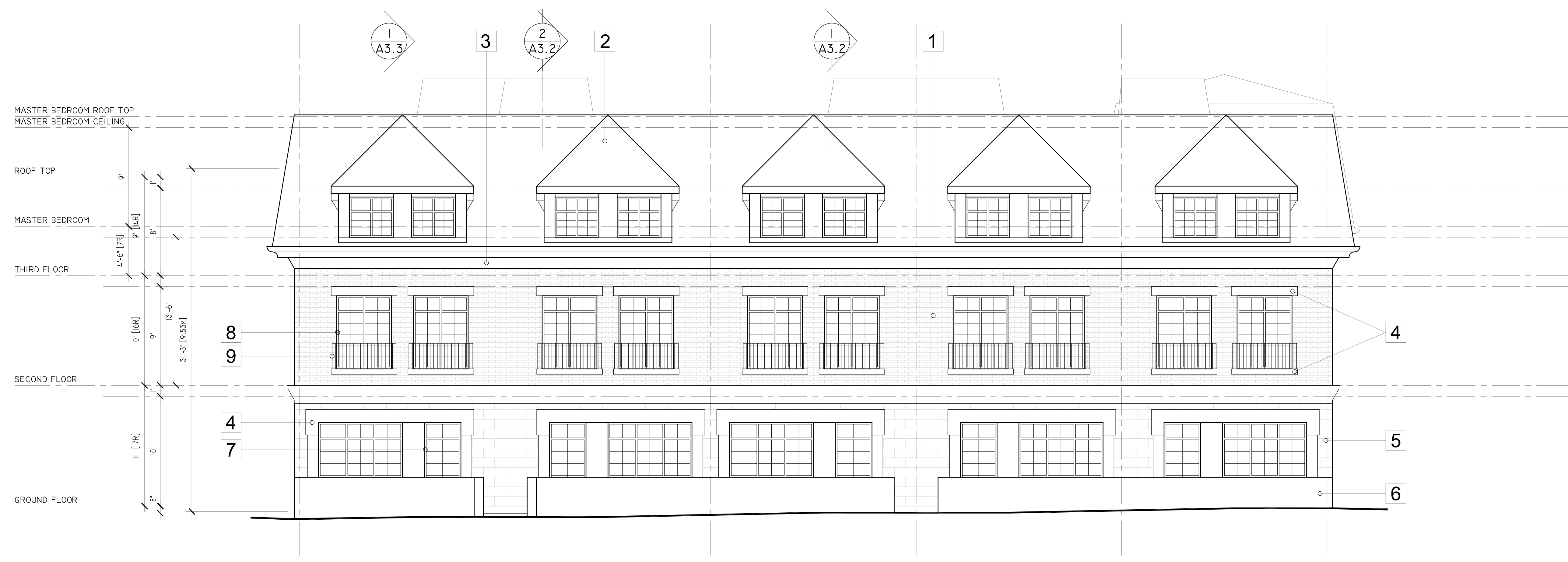
1 NORTH ELEVATION SCALE: 3/16" = 1'-0"