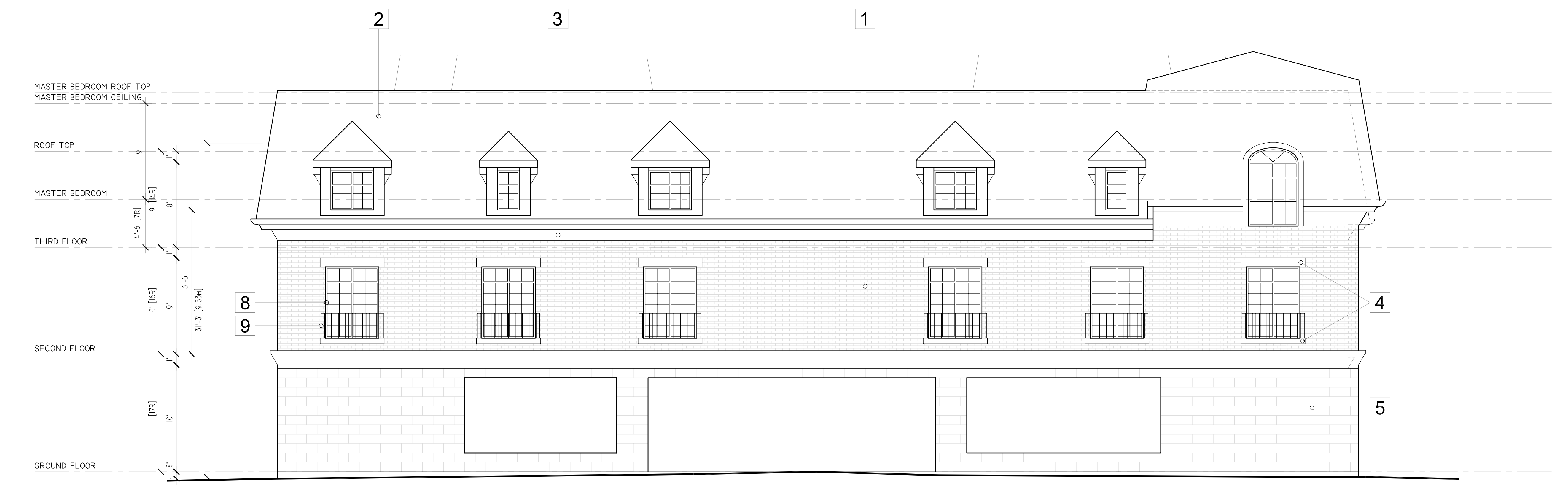
2 WEST ELEVATION SCALE: 3/16" = 1'-0"