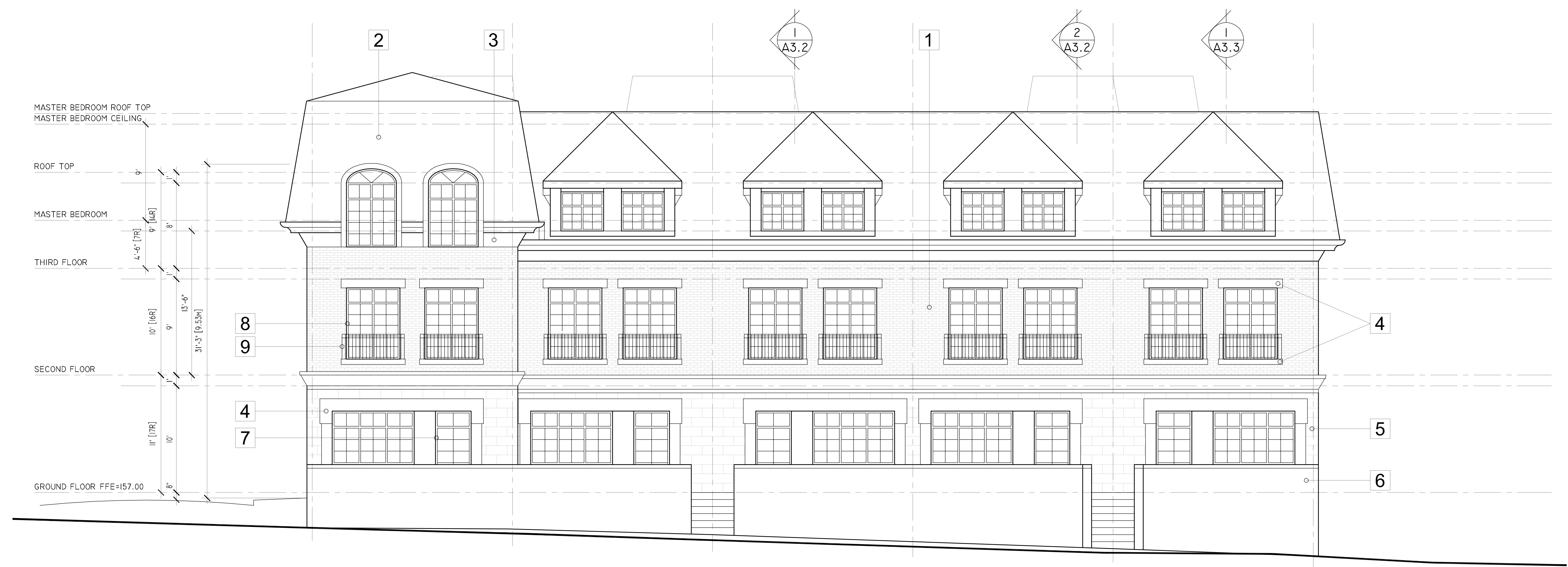
1 SOUTH ELEVATION SCALE: 3/16" = 1'-0"