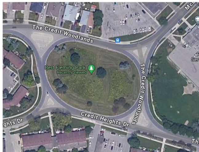
Figure 1: Aerial view of the original configuration of The Credit Woodlands Traffic Circle

Since its installation in the 1950's, this one-way rotary has facilitated quick and easy vehicle movements without having the requirement to stop. As shown in Figure 1 , the road network was originally designed connecting The Credit Woodlands, a minor collector 1 road that runs between Dundas Street West and Burnhamthorpe Road West, with Credit Heights Drive and McBride Avenue.