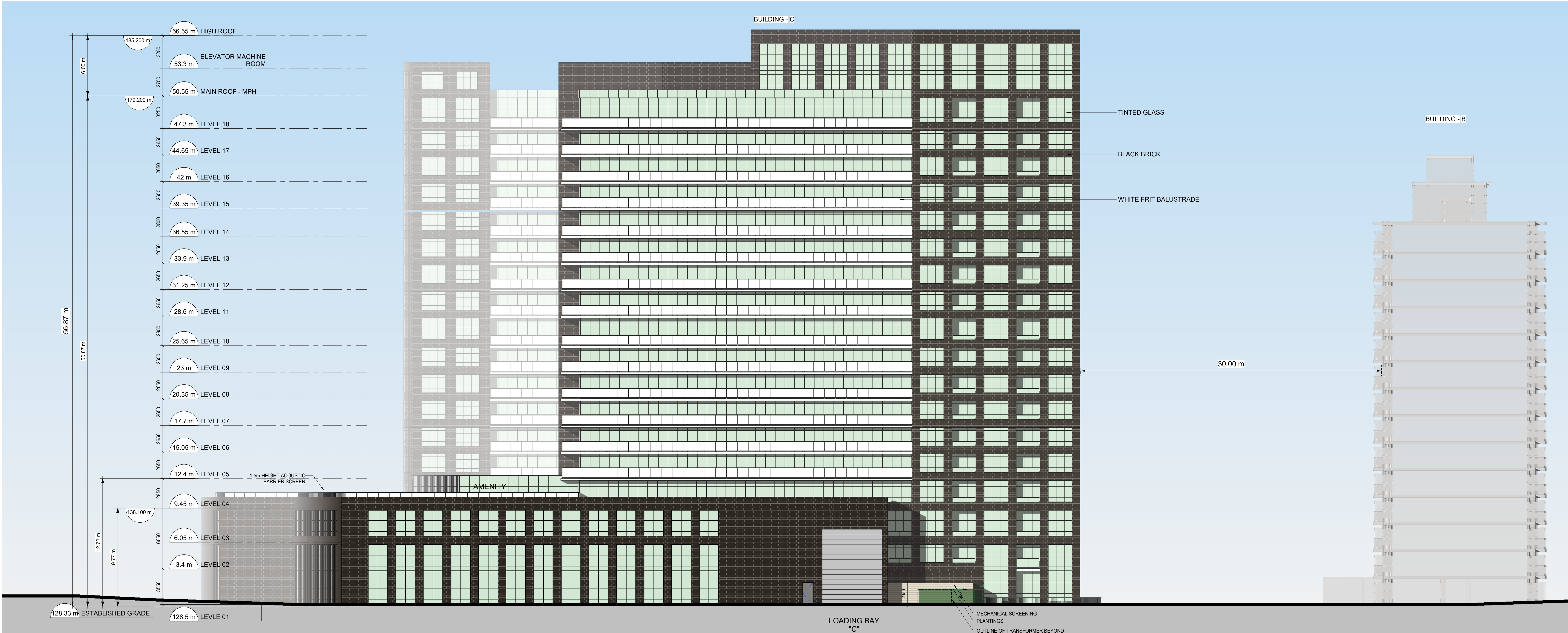
2 EAST ELEVATION A-201 Scale: 1:150