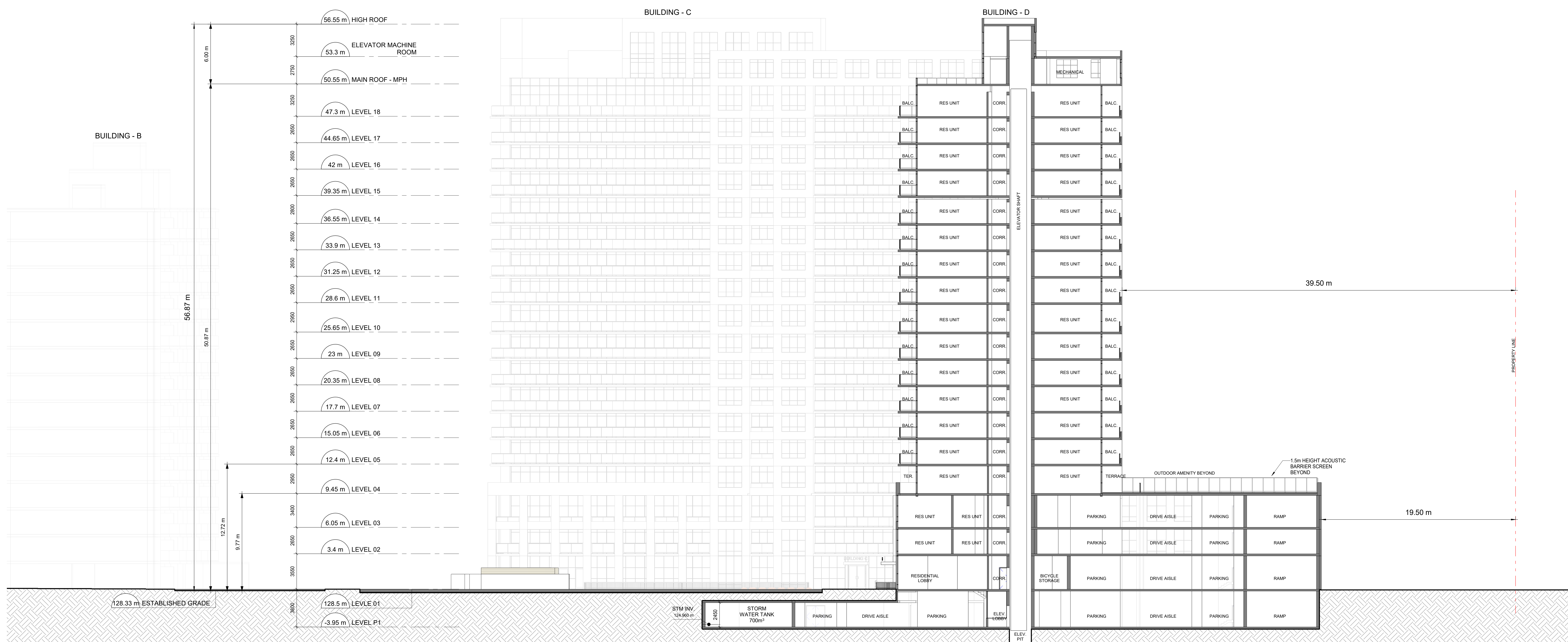
1 NORTH - SOUTH BUILDING - D SECTION A-301 Scale: 1:150