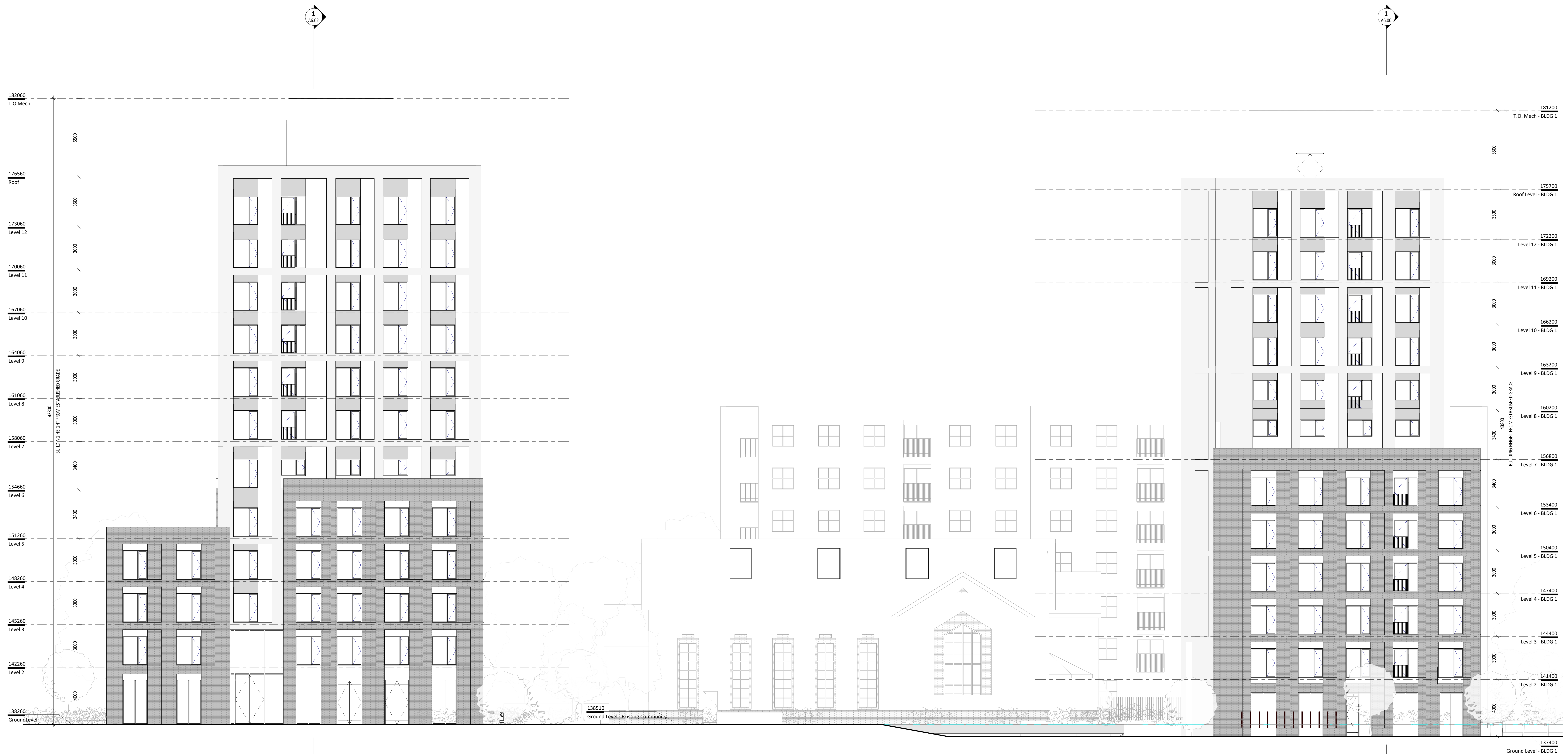
Building 1&2_ZBA_NorthEast Elevation