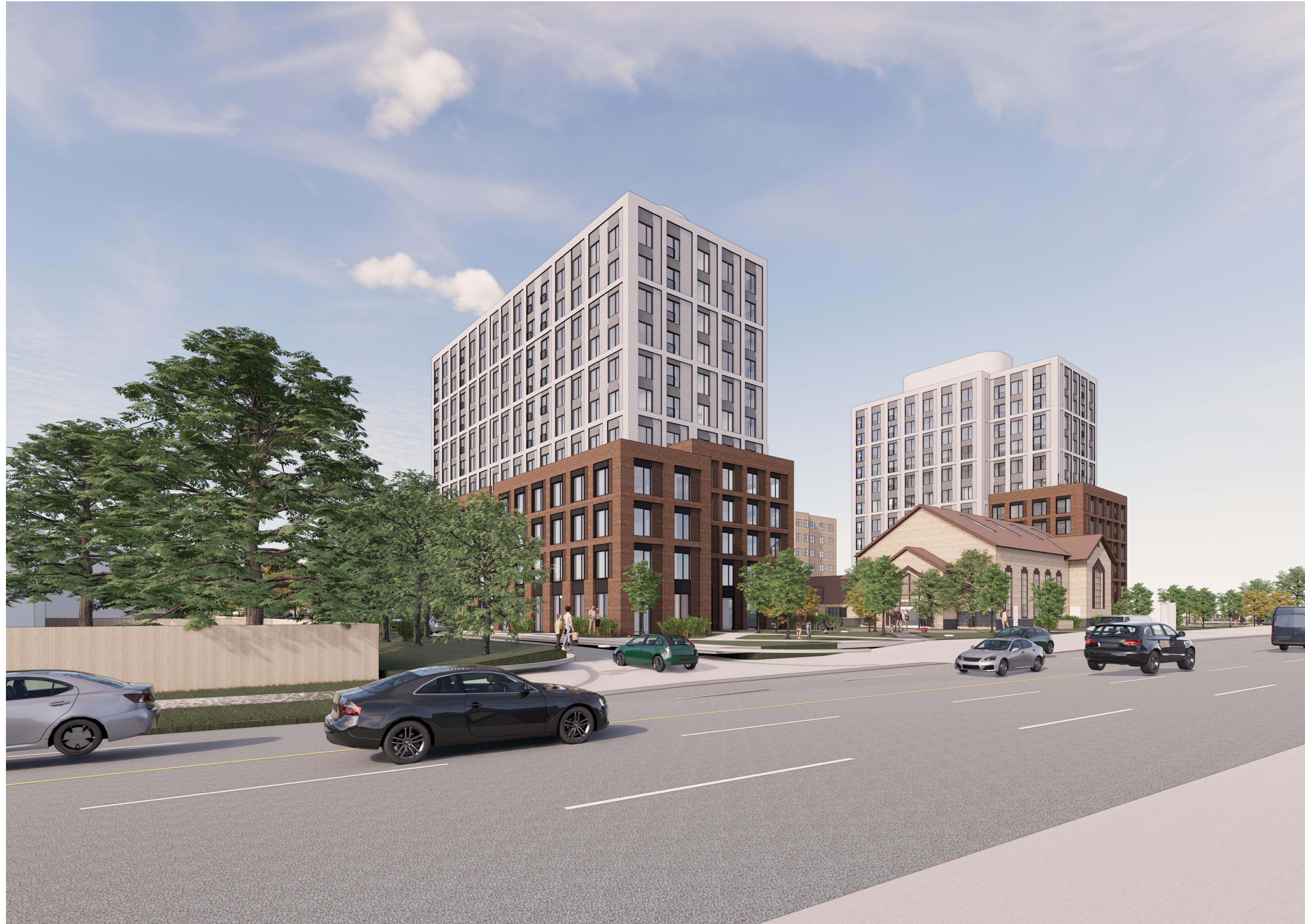
IMAGE 4 - SOUTH TOMKEN ROAD