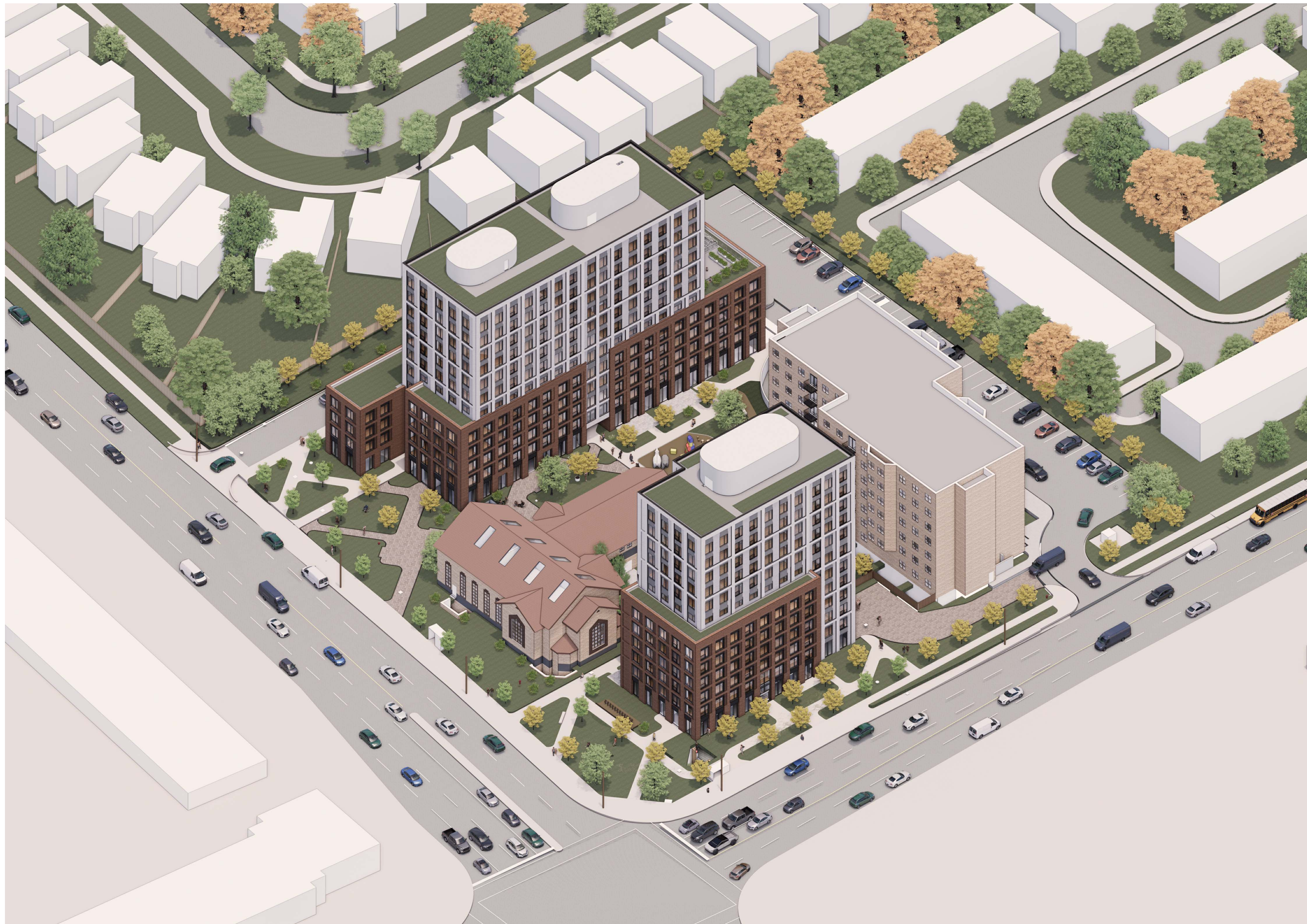
IMAGE 3 - AXO FACING SOUTH WEST