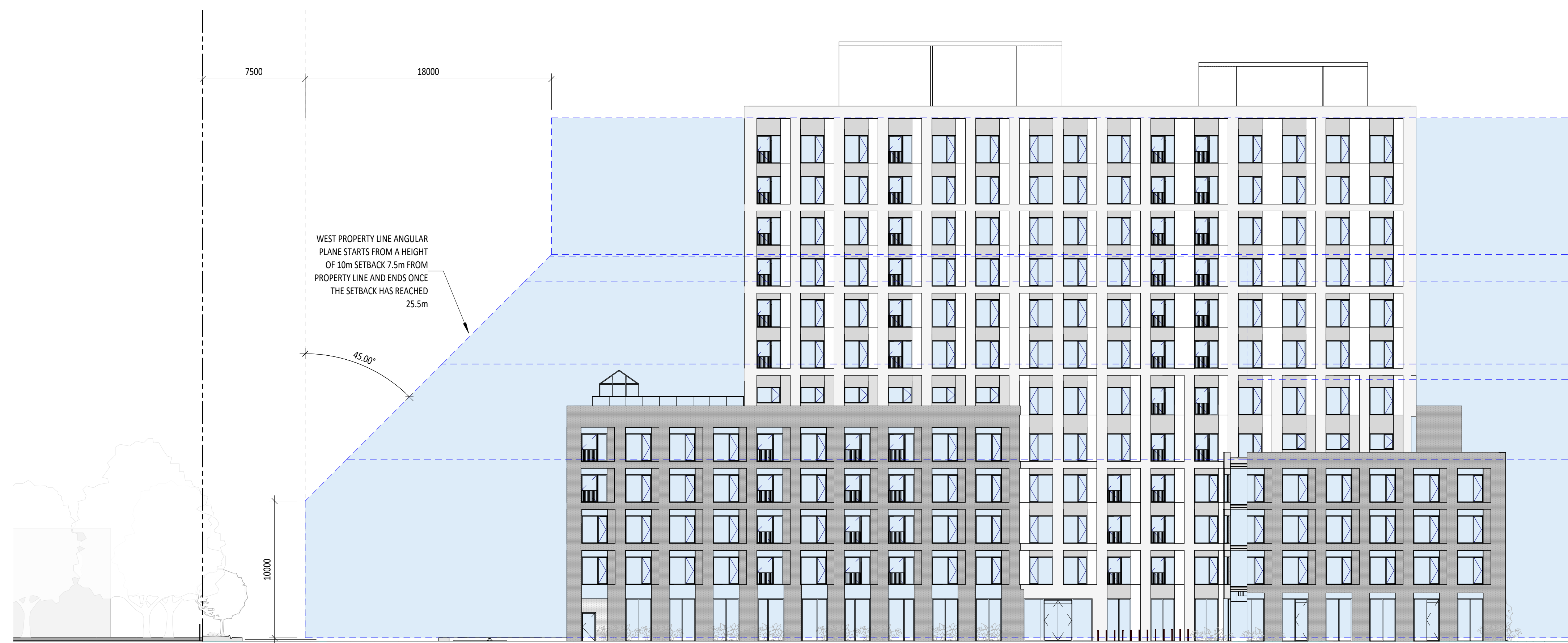
Building_2_ZBA_SouthEast Elevation Angular Plane

Copyright © 2024 of the architect. All rights reserved. This drawing is the property of the architect and is not to be reproduced, stored in a retrieval system, or transmitted in any form or by any means, electronic, mechanical, photocopying, recording, or by any information storage and retrieval system, without the prior written permission of the architect.