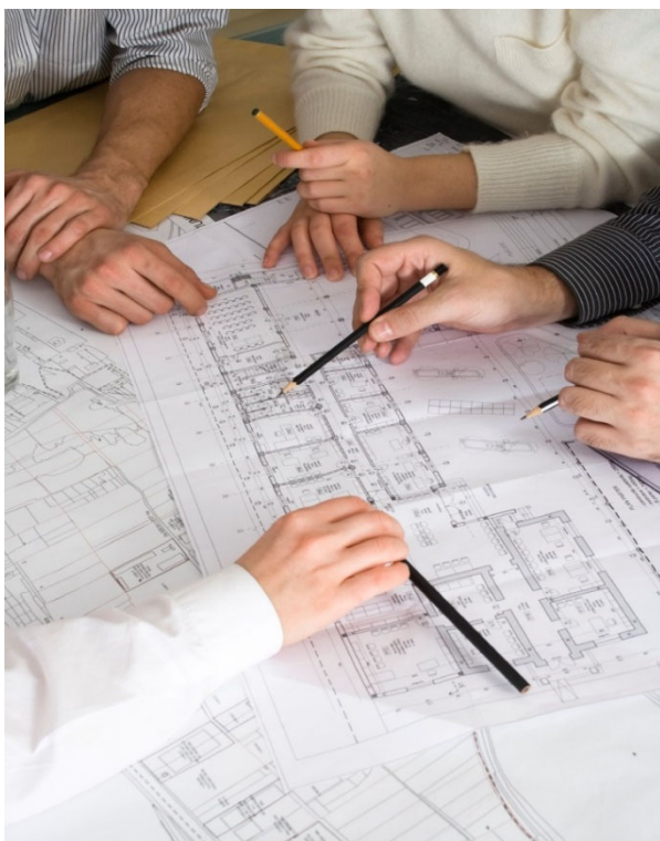
Figure 19-3: Applications for Site Plan Approval will be required to contain sufficient information to ensure compliance with all relevant matters contained in the Planning Act .