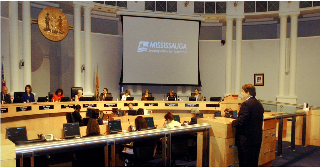
Figure 19-1: Development applications are subject to a number of criteria and require extensive review. Once the application is reviewed with all supporting documentation, the application is presented before City Council for approval.

19.4.2 To ensure that the policies of this Plan are being implemented, the following controls will be regularly evaluated: