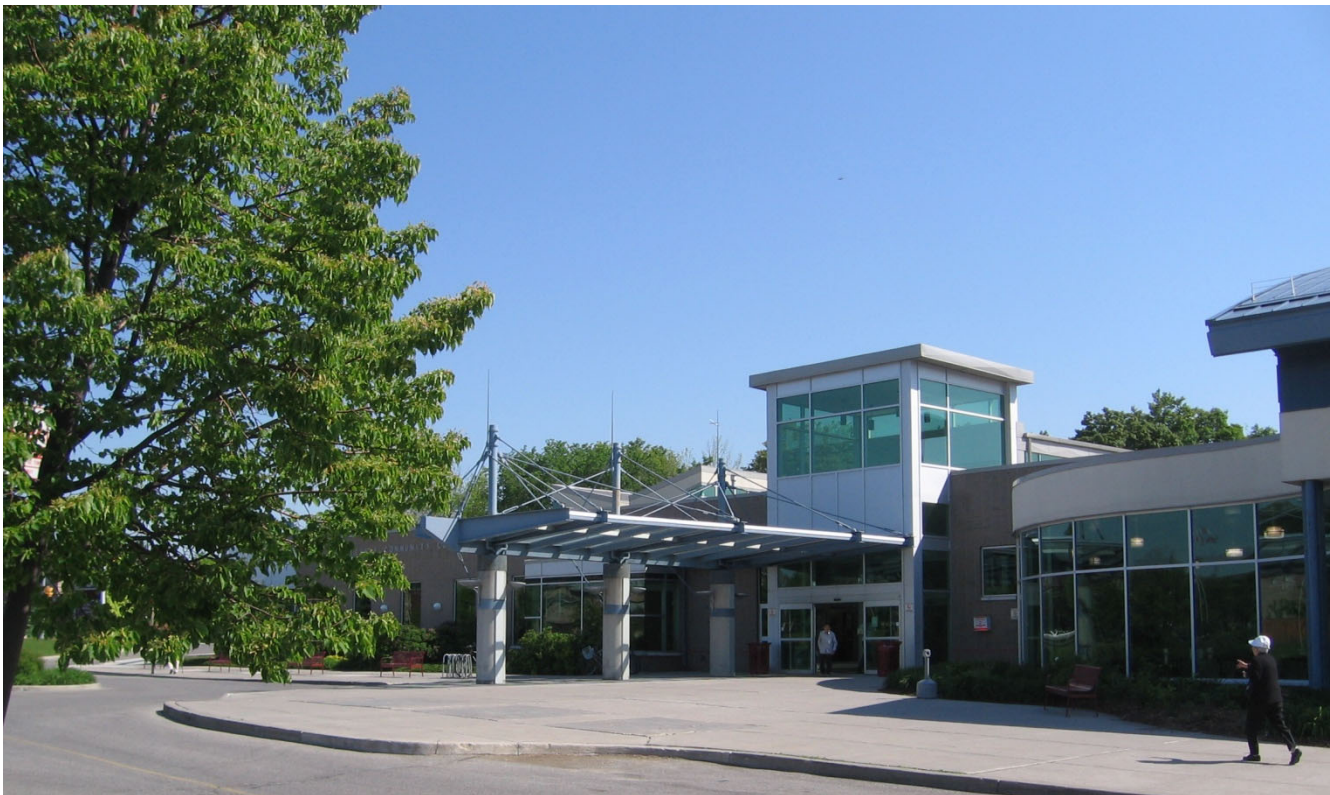
Figure 19-5: Mississauga has many beautiful parks and recreational facilities, such as the Frank McKechnie Community Centre and Library, located in the Hurontario Neighbourhood Character Area. In addition to City reserves, development contributions also play an important role in the creation of open spaces and recreational facilities for all residents to enjoy.