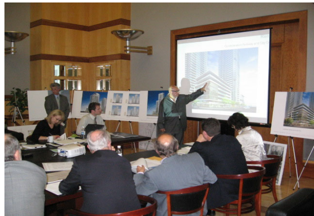
Figure 19-4: A Design Review Panel may be created to provide advice on applications, specifically design related matters that may affect the public realm. Development proponents may be required to submit their application to this Panel for review.

19.17.1 Mississauga will encourage and recognize creativity; sustainability and design excellence in architecture; landscape and urban design and