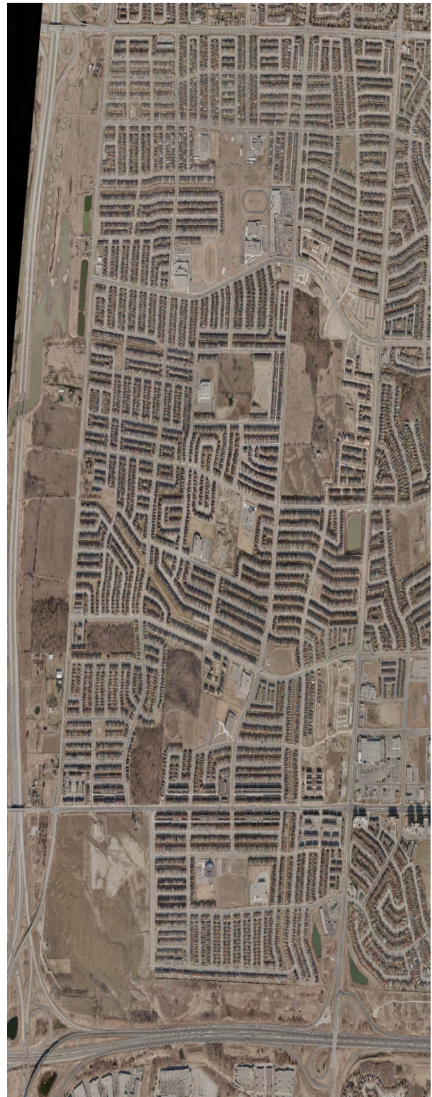
Figure 19-2: Although most of Mississauga is built out, there are still portions of the city that will require a plan of subdivision. Churchill Meadows is one of Mississauga's most recent communities that exemplifies good planning, with appropriate road connections, built form, servicing and a mix of uses.