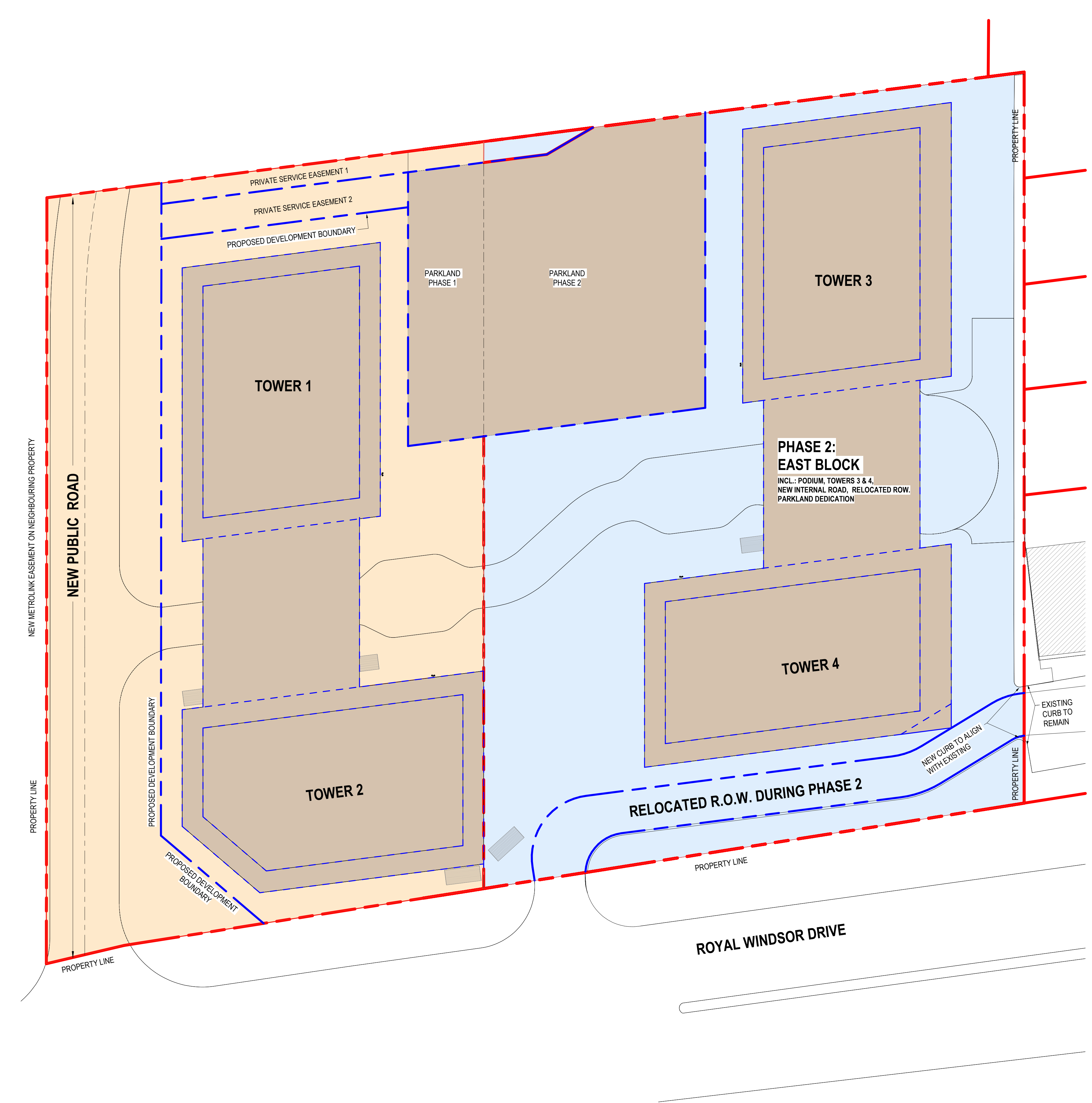
2 PHASING PLAN - EAST BLOCK SCALE: 1:300