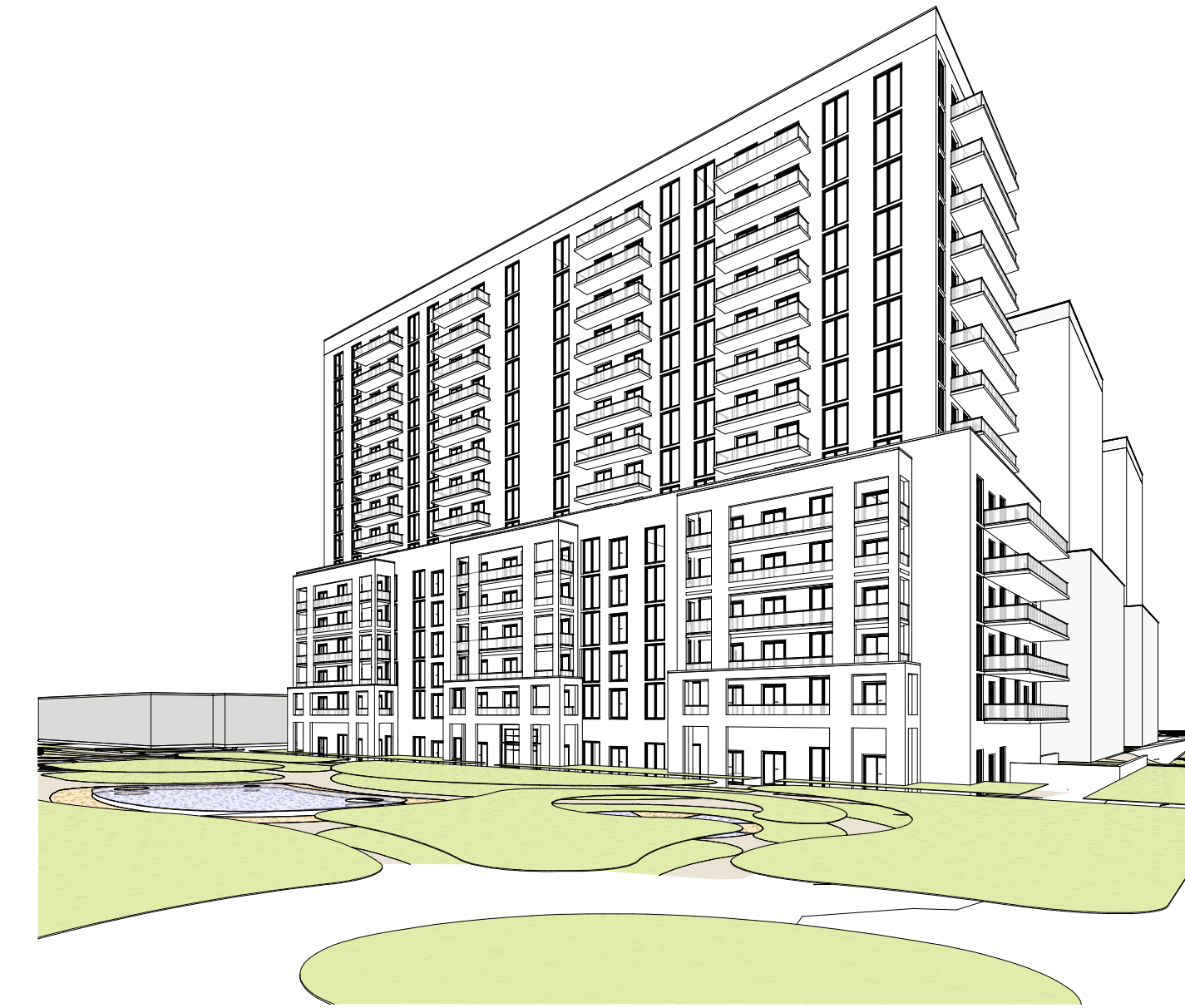
3 SOUTH WEST PERSPECTIVE VIEW