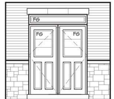
INSIDE PORTICO ELEVATION