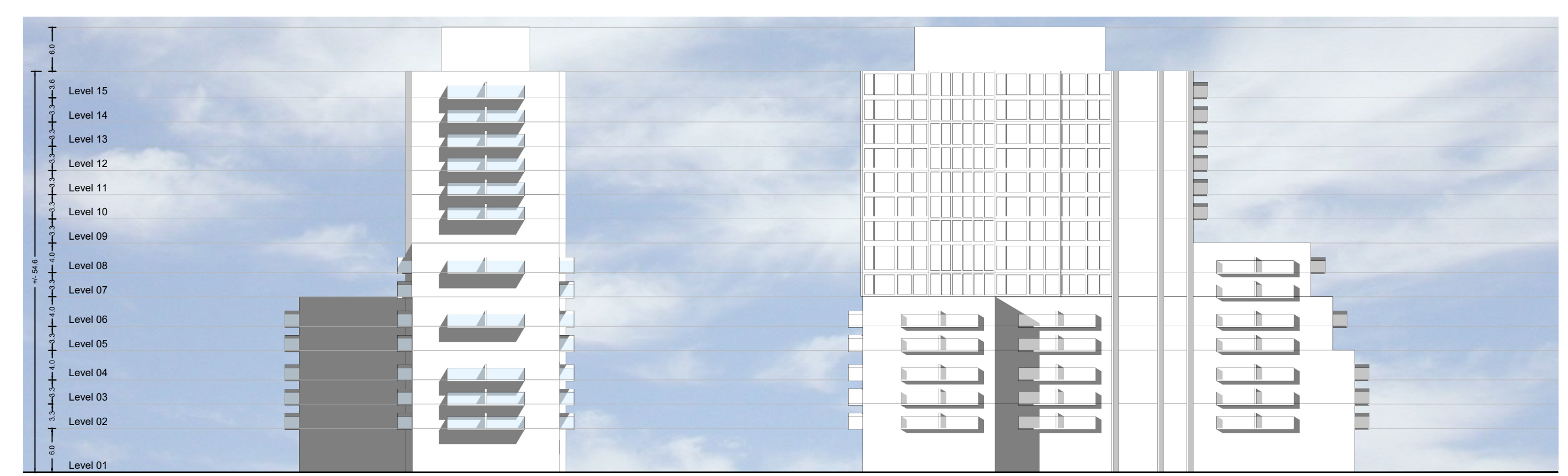
North Elevation Facing Market Square