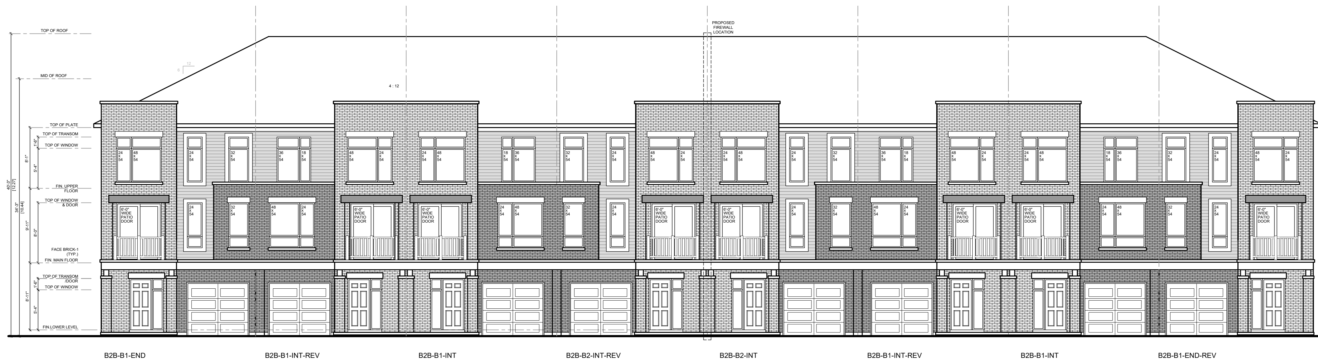
BLOCK 11 FRONT ELEVATION 3 STOREY 6.1M BACK TO BACK TOWNS STYLE B