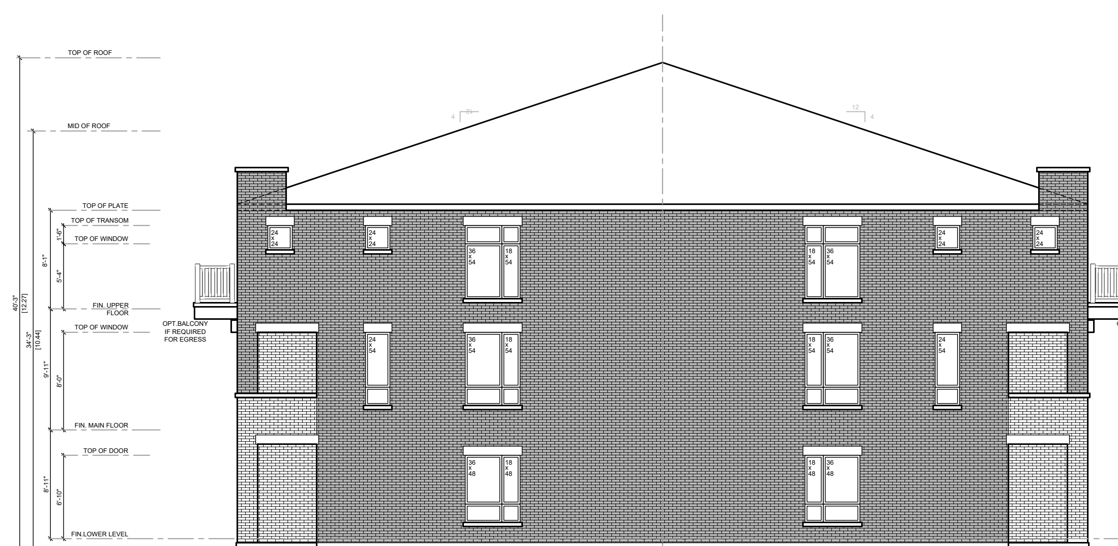
BLOCKS 3 & 10 SIDE ELEVATION 3 STOREY 6.1M BACK TO BACK TOWNS STYLE A