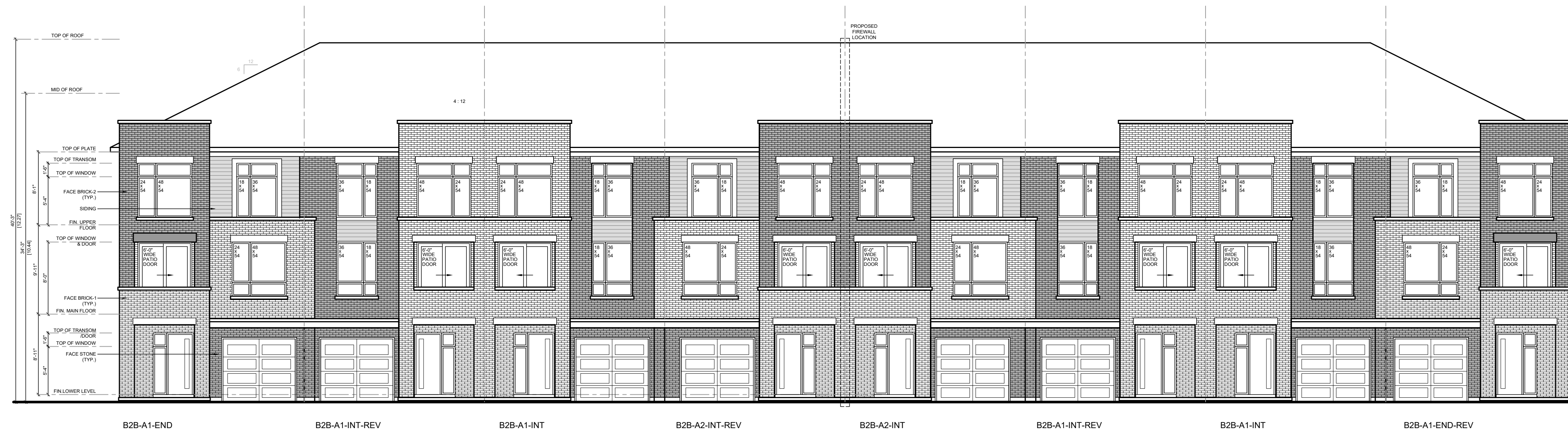
BLOCKS 3 & 10 FRONT ELEVATION 3 STOREY 6.1M BACK TO BACK TOWNS STYLE A