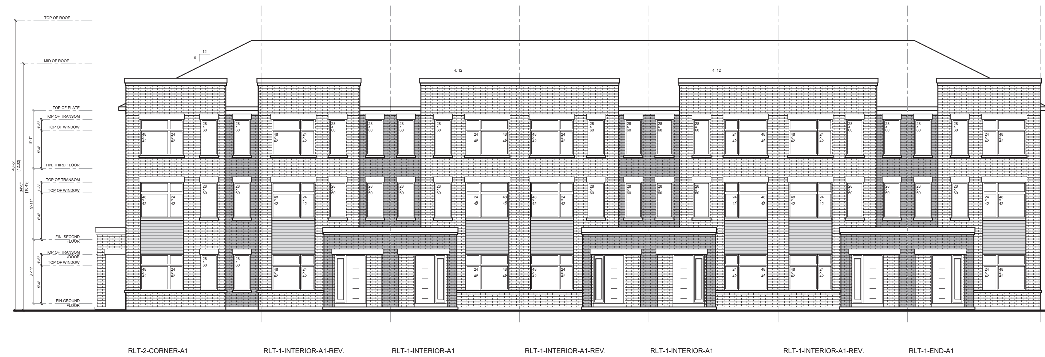
BLOCK 2 FRONT ELEVATION 3 STOREY 5.5M REAR LANE TOWNHOUSES STYLE A