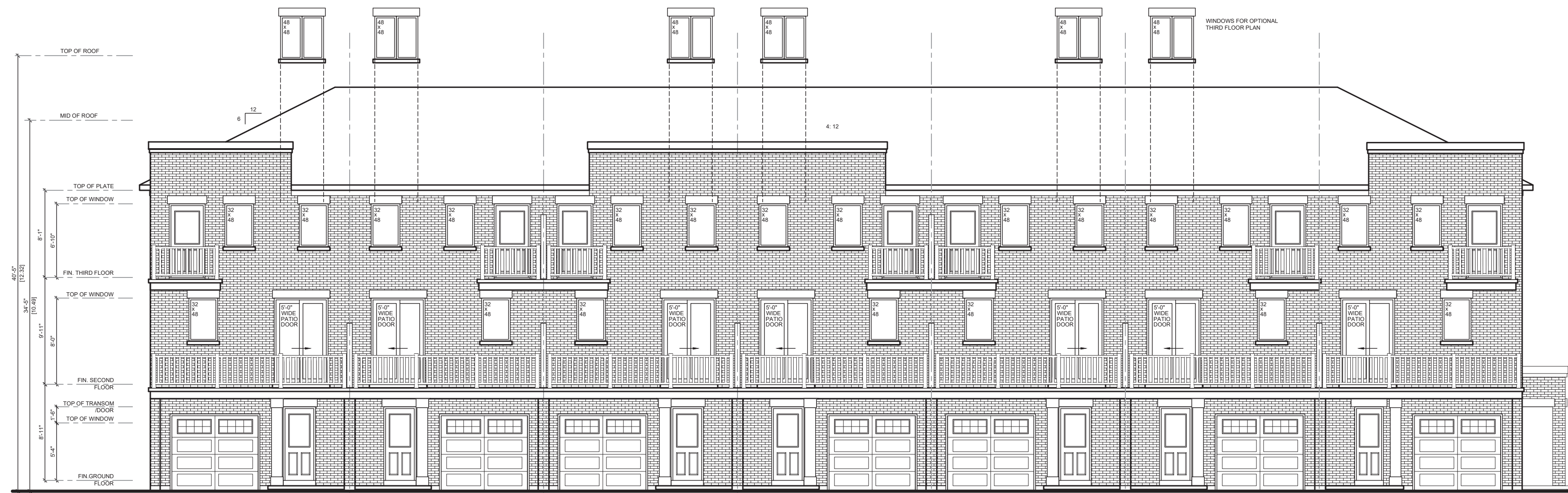
BLOCK 2 REAR ELEVATION 3 STOREY 5.5M REAR LANE TOWNHOUSES STYLE A