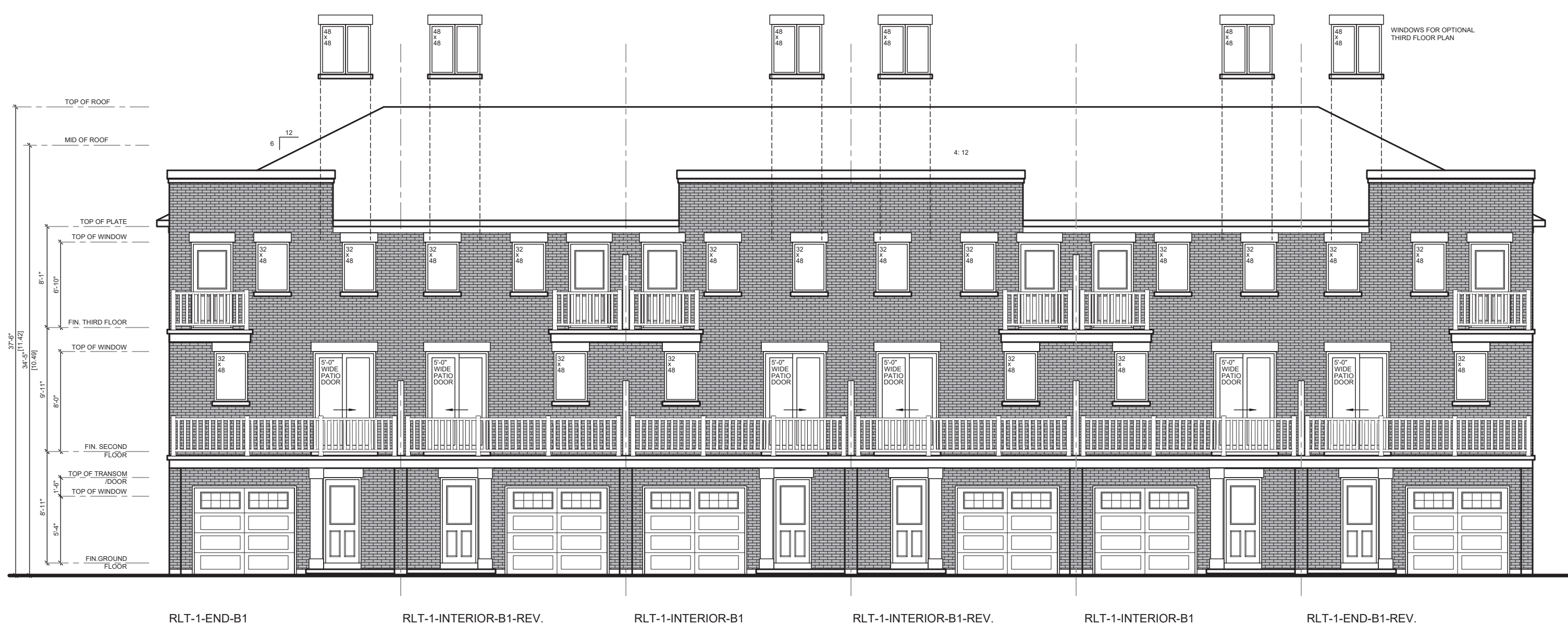
BLOCK 1 FRONT ELEVATION 3 STOREY 5.5M REAR LANE TOWNHOUSES STYLE B