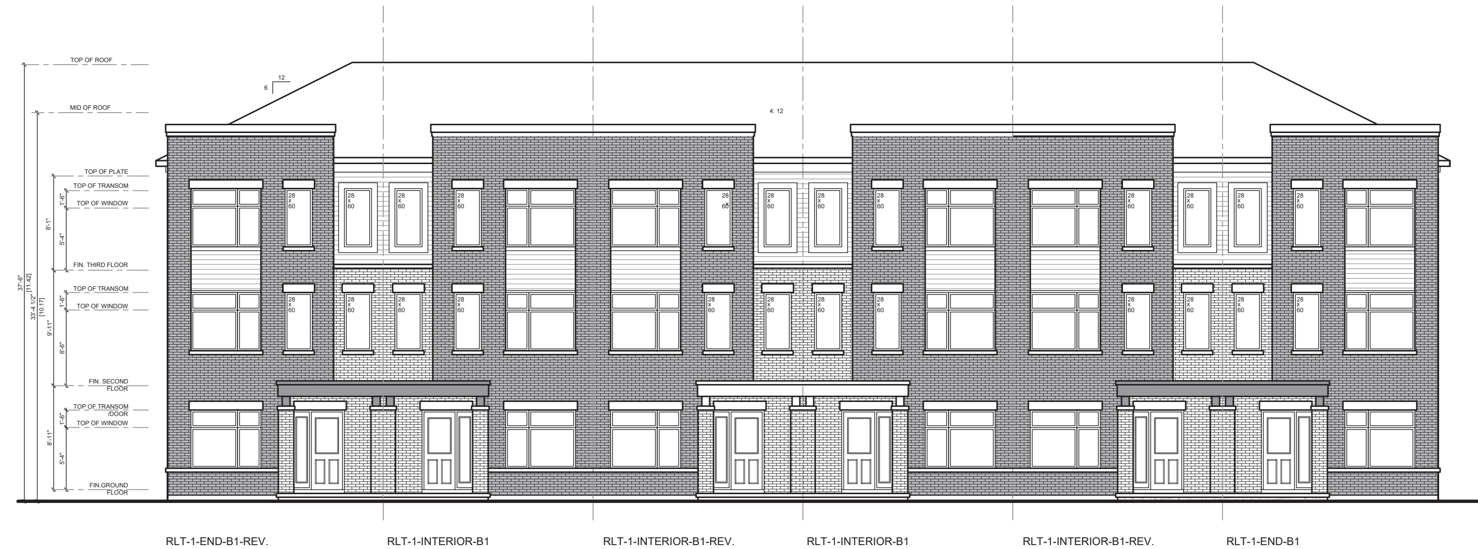
BLOCK 1 FRONT ELEVATION 3 STOREY 5.5M REAR LANE TOWNHOUSES STYLE B