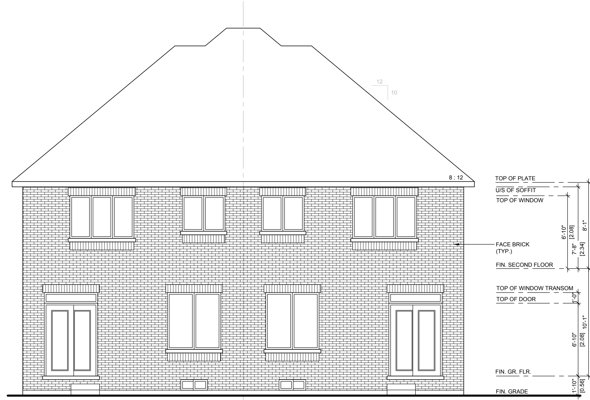
SD-1-A1-REV. SD-1-A1 REAR ELEVATION 3 STOREY SEMI-DETACHED DWELLING STYLE 'A'