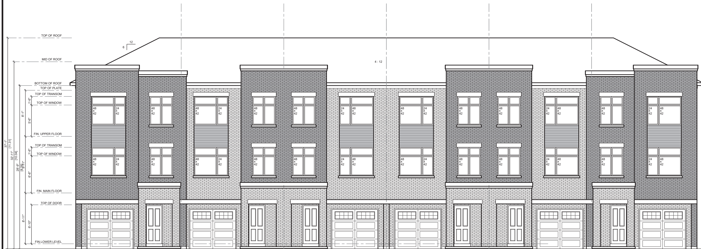
BLOCK 7 FRONT ELEVATION 3 STOREY 5.5M TRADITIONAL TOWNHOUSE STYLE A