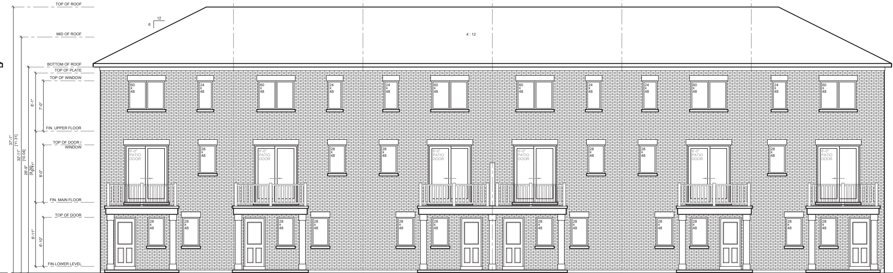
BLOCK 7 REAR ELEVATION 3 STOREY 5.5M TRADITIONAL TOWNHOUSE STYLE A