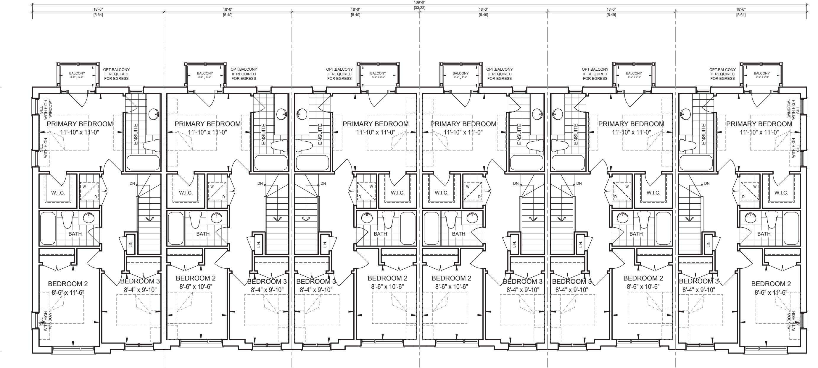
UPPER LEVEL FLOOR PLAN STYLE 'A'

THIS DRAWING IS NOT TO BE SCALED. THE CONTRACTOR MUST VERIFY AND ACCEPT RESPONSIBILITY FOR ALL DIMENSIONS AND CONDITIONS ON SITE AND MUST NOTIFY THE ARCHITECT OF ANY VARIATIONS FROM THE SUPPLIED INFORMATION. THE ARCHITECT IS NOT RESPONSIBLE FOR THE ACCURACY OF SURVEY, STRUCTURAL, MECHANICAL, ELECTRICAL, AND ALL OTHER ENGINEERING INFORMATION AND INTERIOR DESIGN AND LANDSCAPE CONSTRUCTION MUST CONFORM TO ALL APPLICABLE LAWS, CODES AND REQUIREMENTS. ALL ARCHITECTURAL SYMBOLS INDICATED ARE GRAPHIC REPRESENTATIONS ONLY. THIS DRAWING AND SPECIFICATIONS IS NOT TO BE USED FOR CONSTRUCTION PURPOSES.