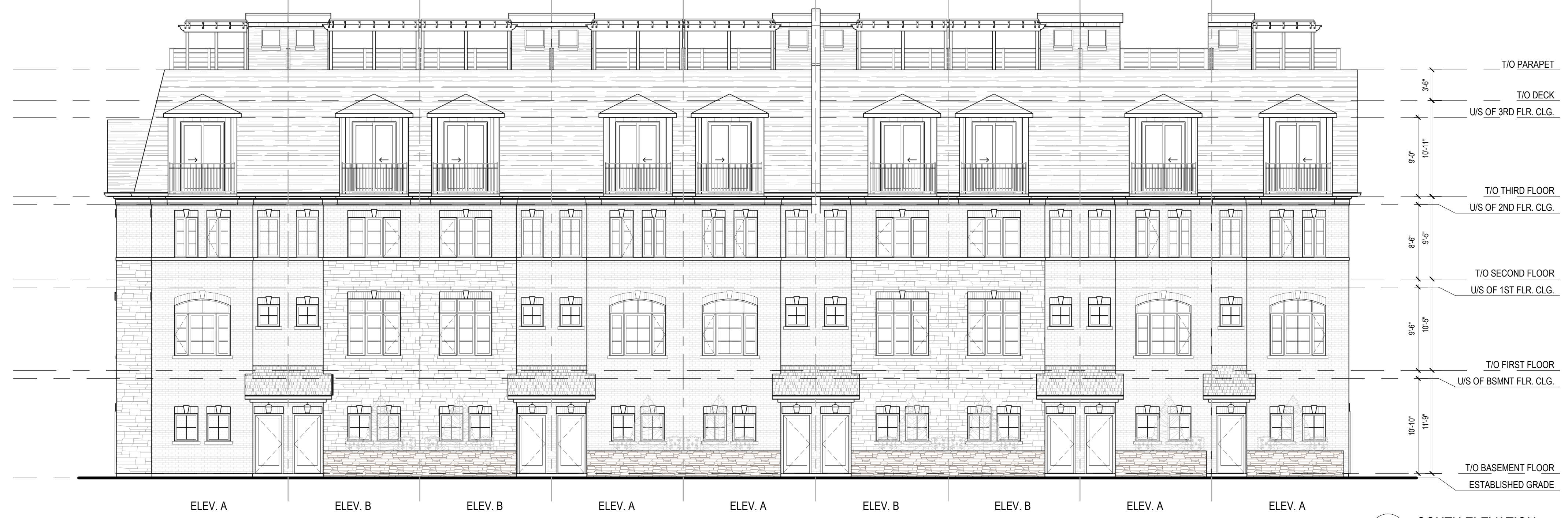
4 SOUTH ELEVATION SCALE: 1/8" = 1'-0"