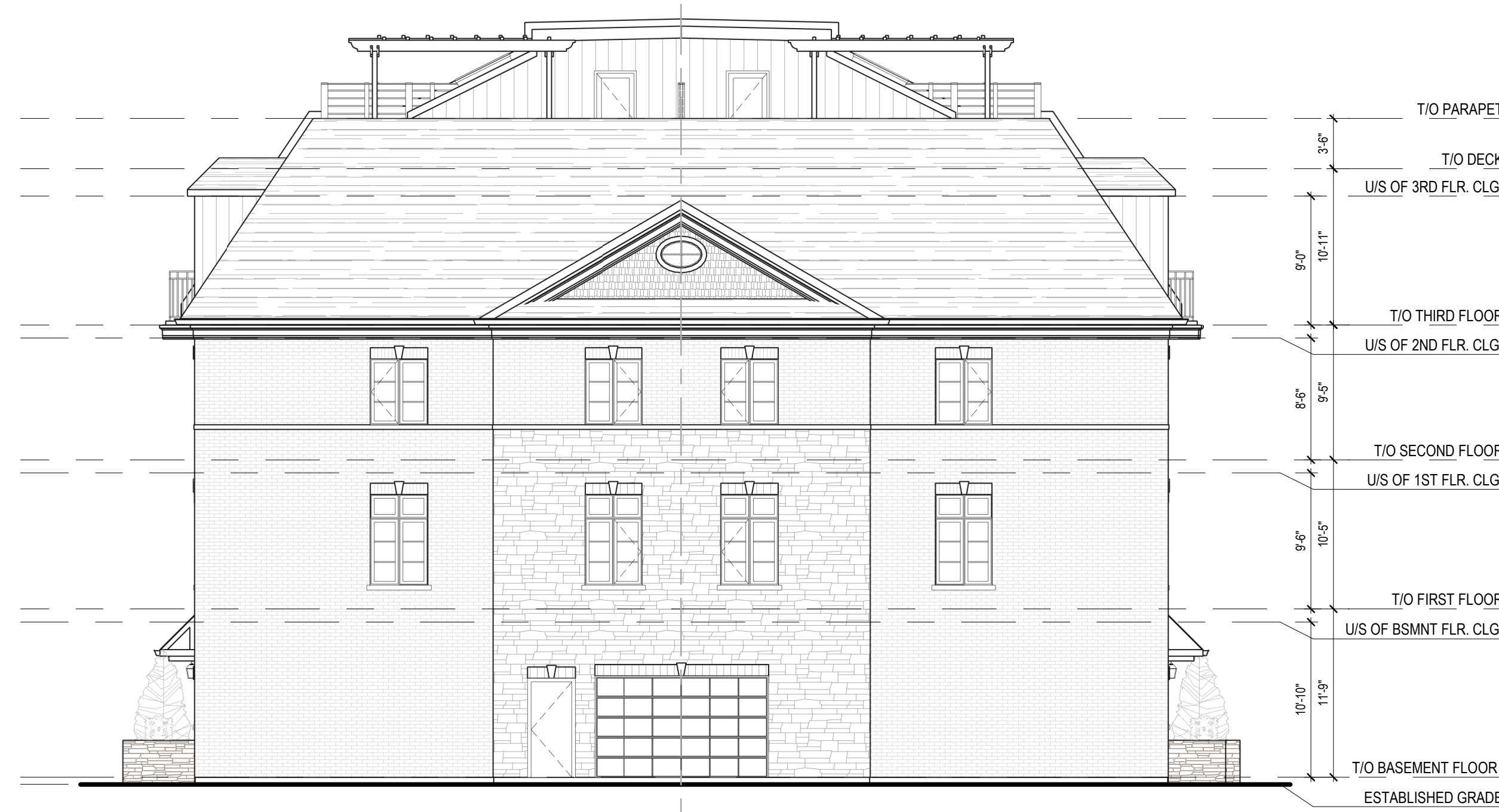
3 WEST ELEVATION SCALE: 1/8" = 1'-0"