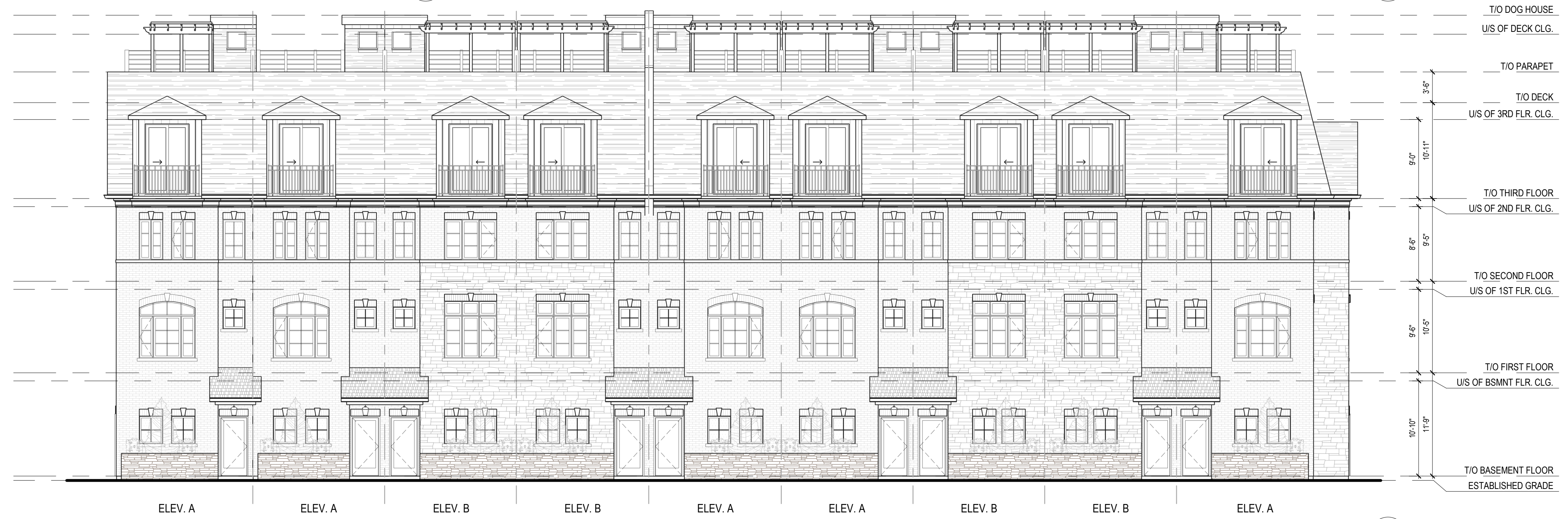
1 NORTH ELEVATION SCALE: 1/8" = 1'-0"

INFINITY ARCHITECTURE & DESIGN 4 APPELEY ROAD, ETOBICOKE ON M9B 4Z9