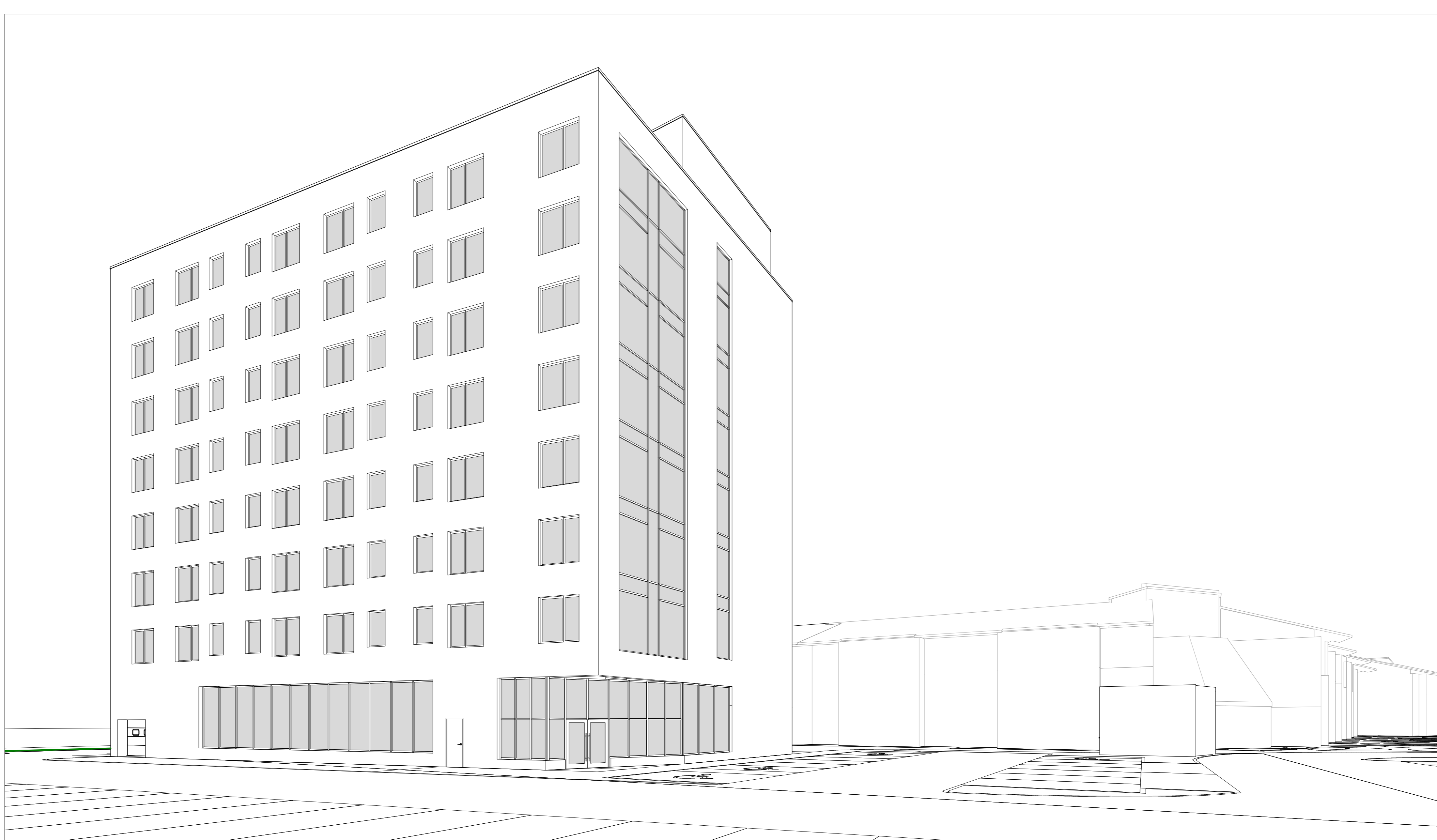
1 3D VIEW - SOUTH EAST CORNER A001