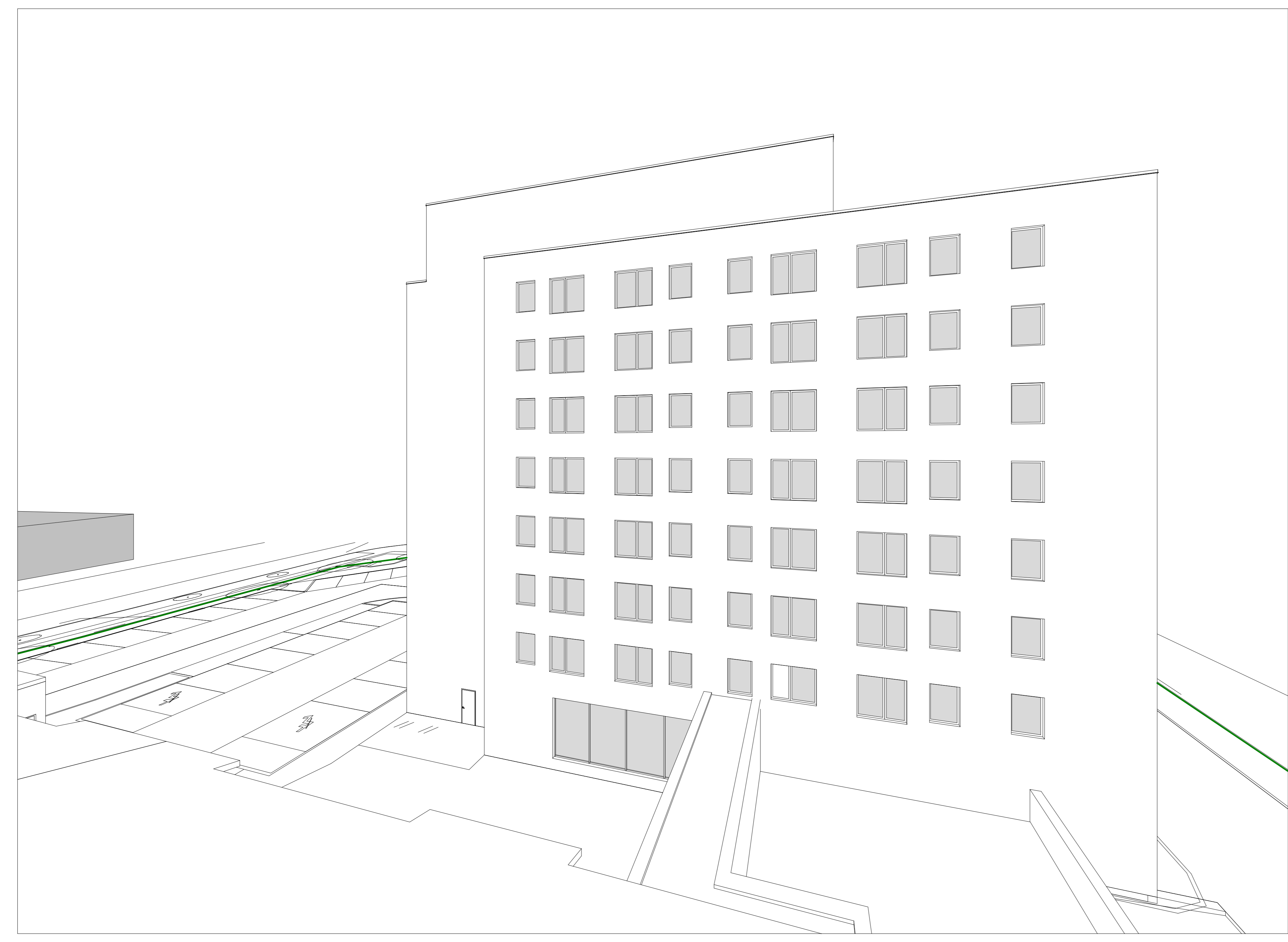
3 3D VIEW - SOUTH A001