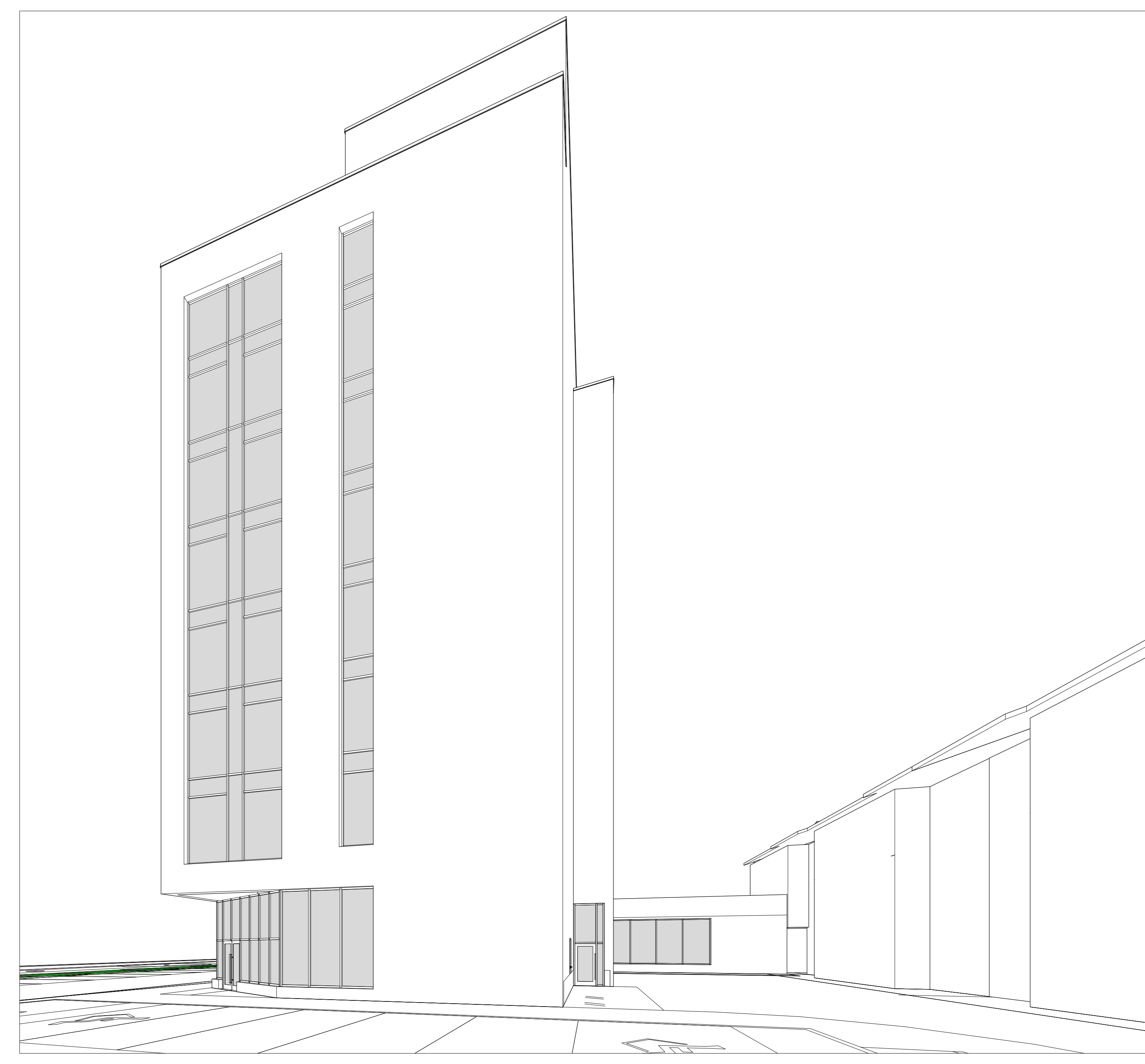
4 3D VIEW - NORTH EAST CORNER A001