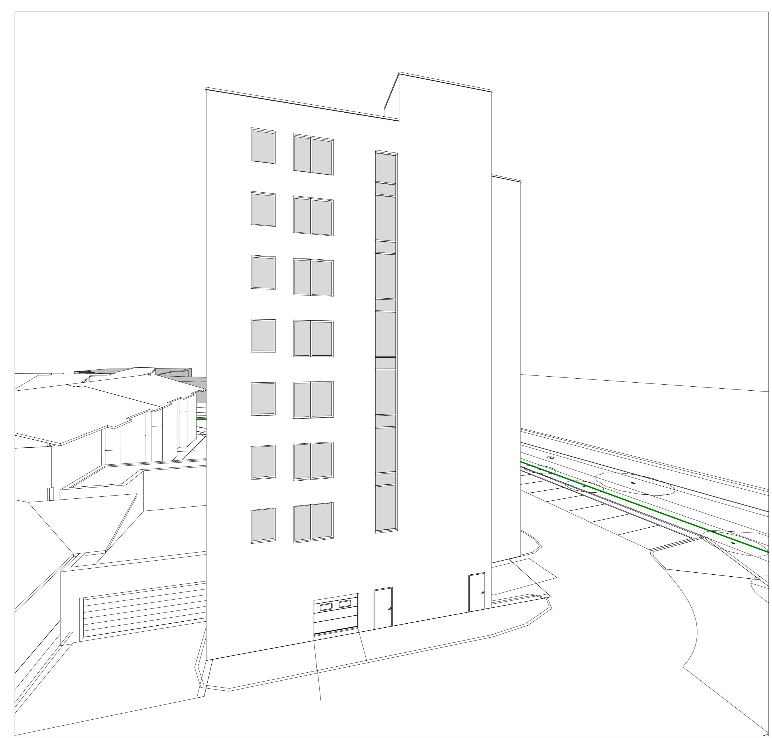
2 3D VIEW - SOUTH WEST CORNER A001