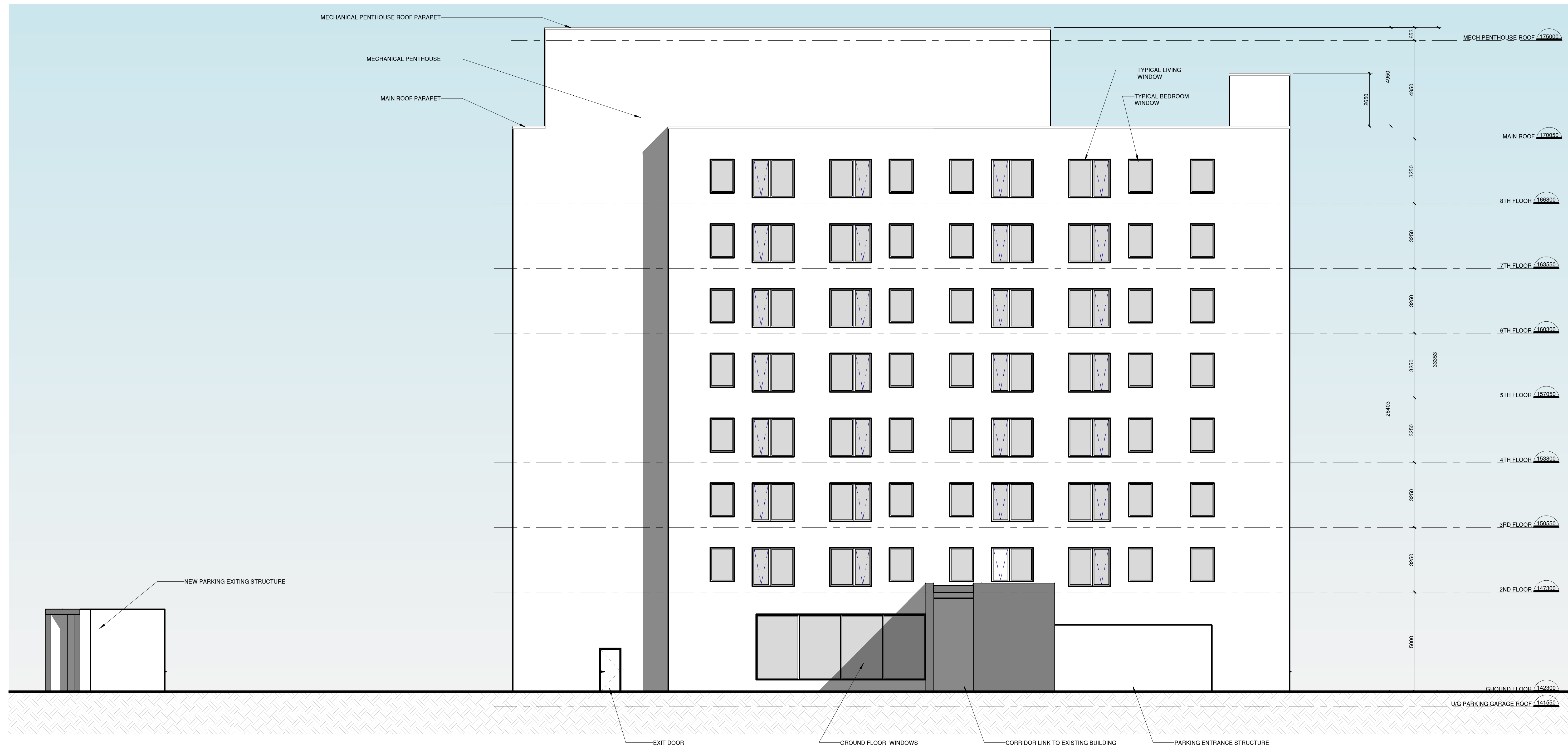
1 NORTH ELEVATION A402 1:100

67 Howat Avenue, Suite 412 Toronto, Ontario, M6K 3E3 T: 416.538.5666 F: 416.538.8626 kma.com