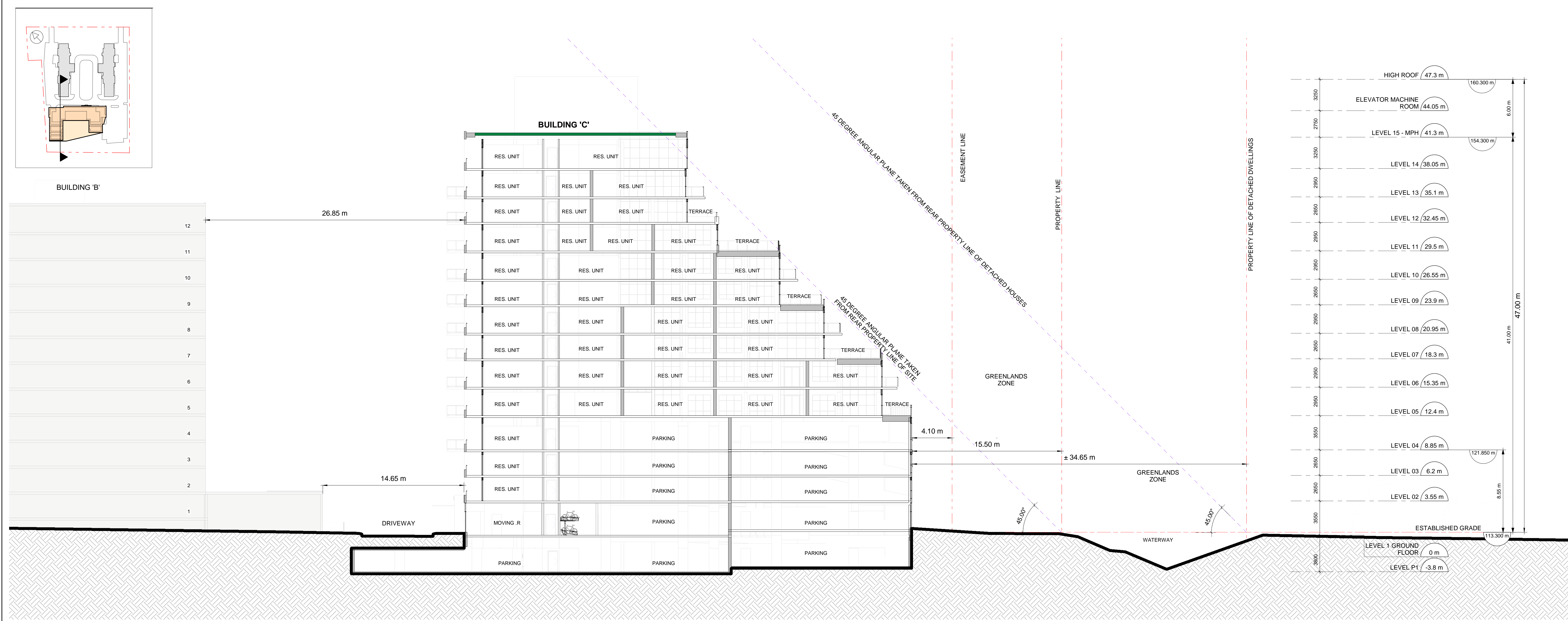
1 EAST-WEST BUILDING SECTION A-301 Scale: 1 : 150