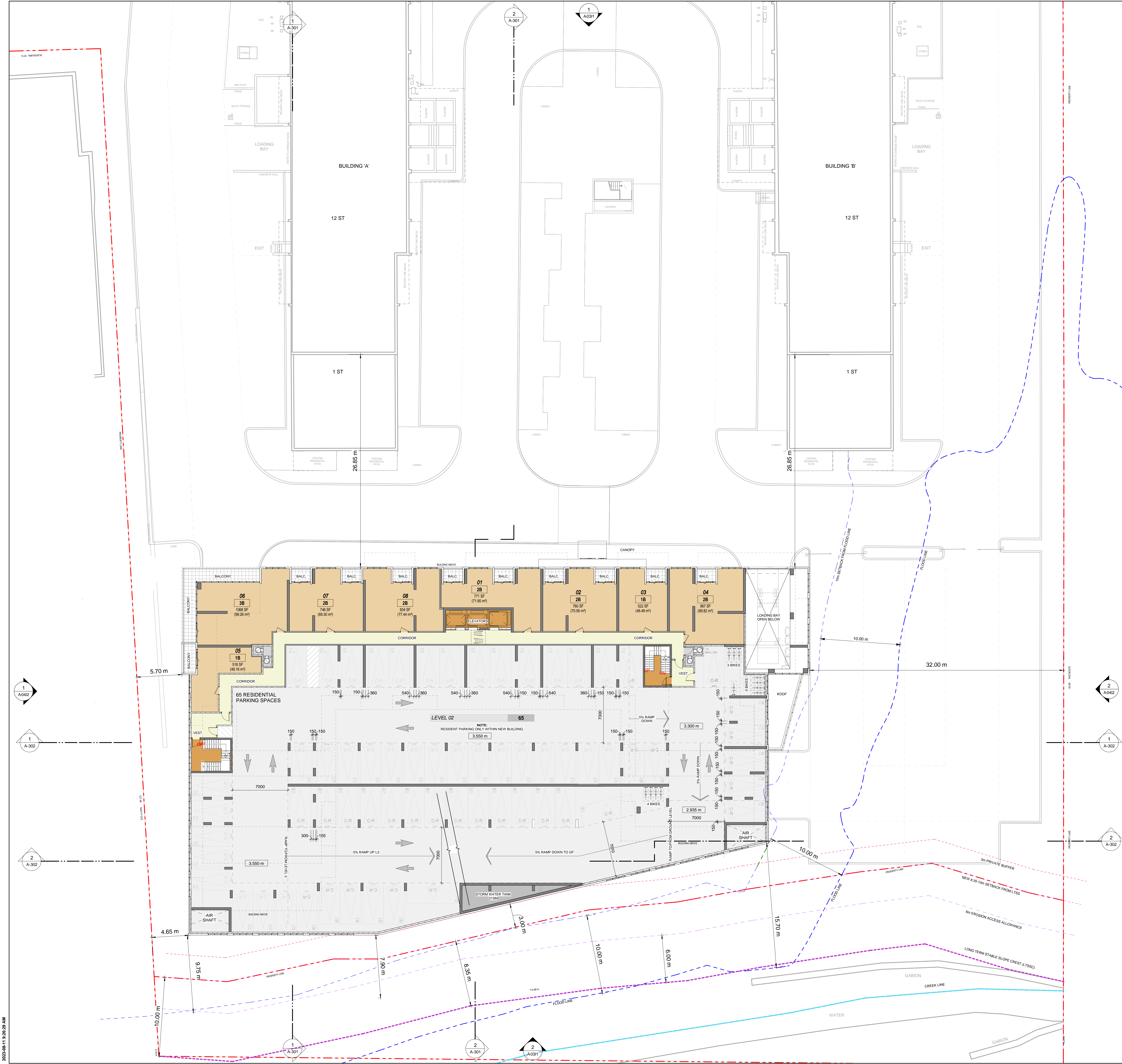
LEVEL 2 FLOOR PLAN Scale: 1 : 150