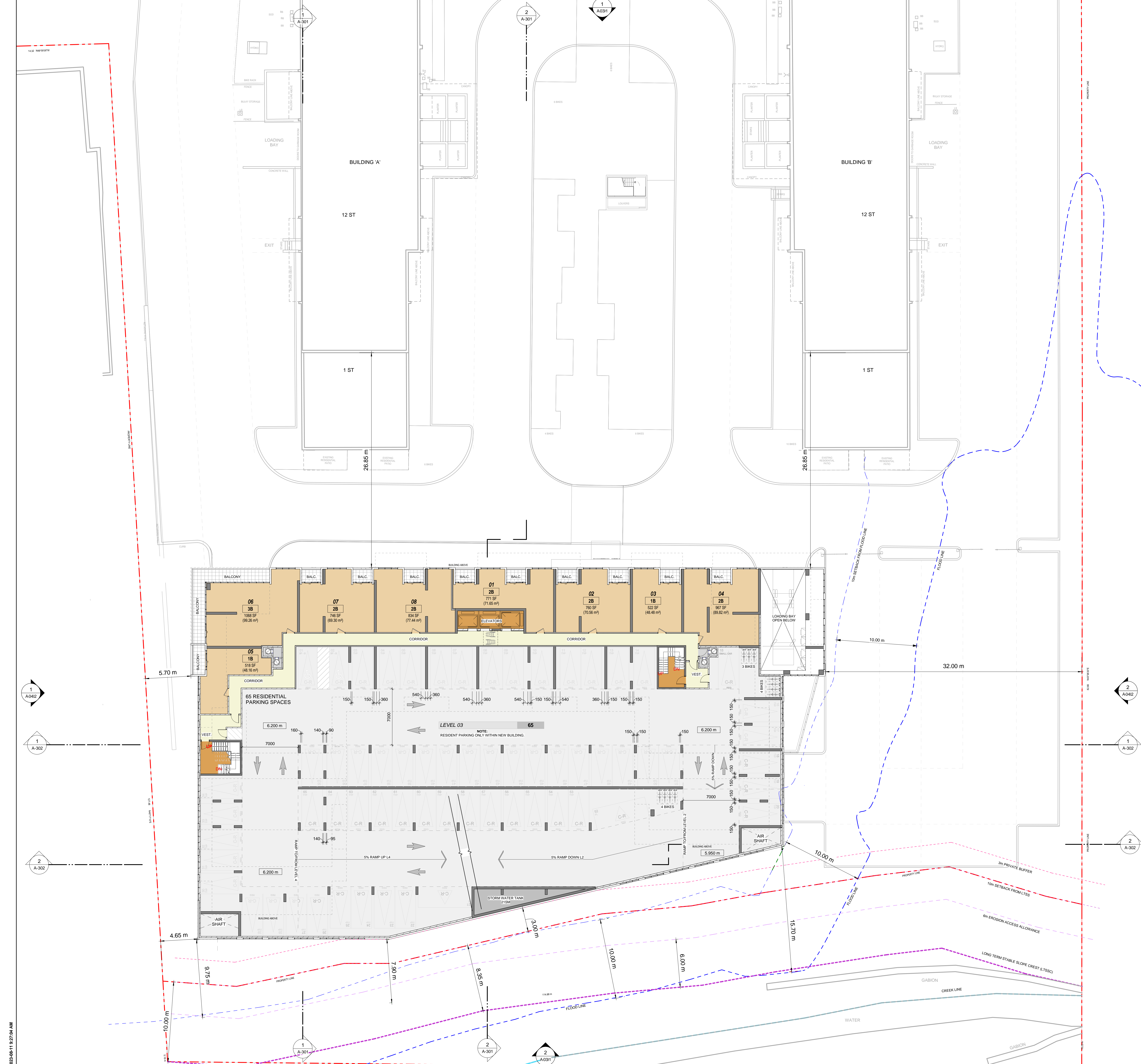
LEVEL 3 FLOOR PLAN Scale: 1:150