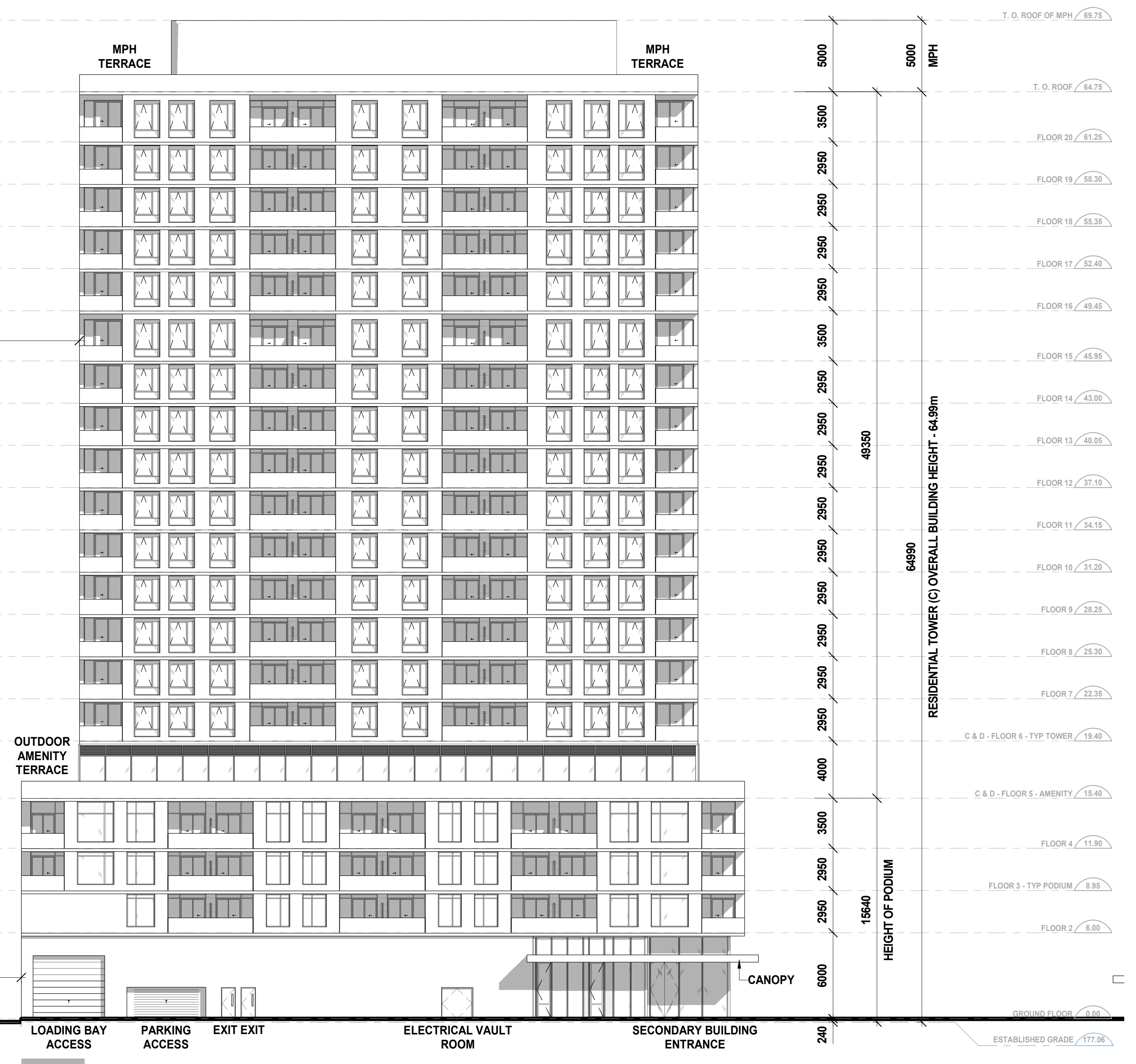
2 BUILDING C - EAST ELEVATION A403.S