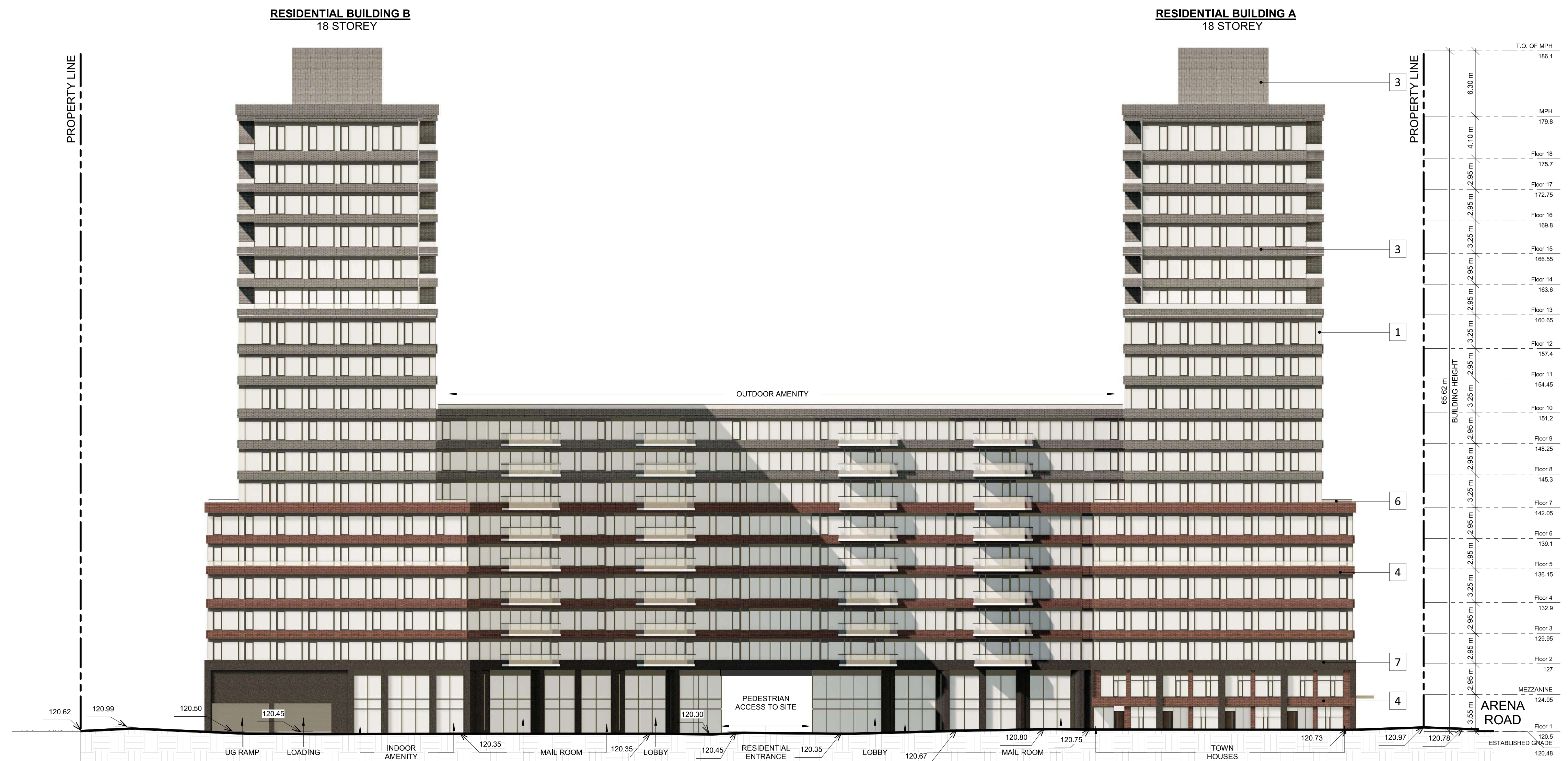
2 WEST ELEVATION SPA302 1:250