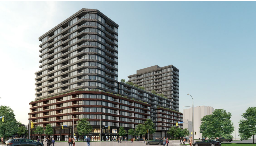
Proposed rendering of the development, looking northeast across the Subject Lands (image provided by Turner Fleischer Architects)

The proposal has also been planned and designed around the introduction of an optimal site design and high-quality, refined built forms. Overall, the proposed development is to have a total gross floor area ('GFA') of the proposed development is to have a total gross floor area ('GFA') approximately 47,546.6 square metres (511,787 square feet), resulting in a density of 3.82 Floor Space Index ('FSI').