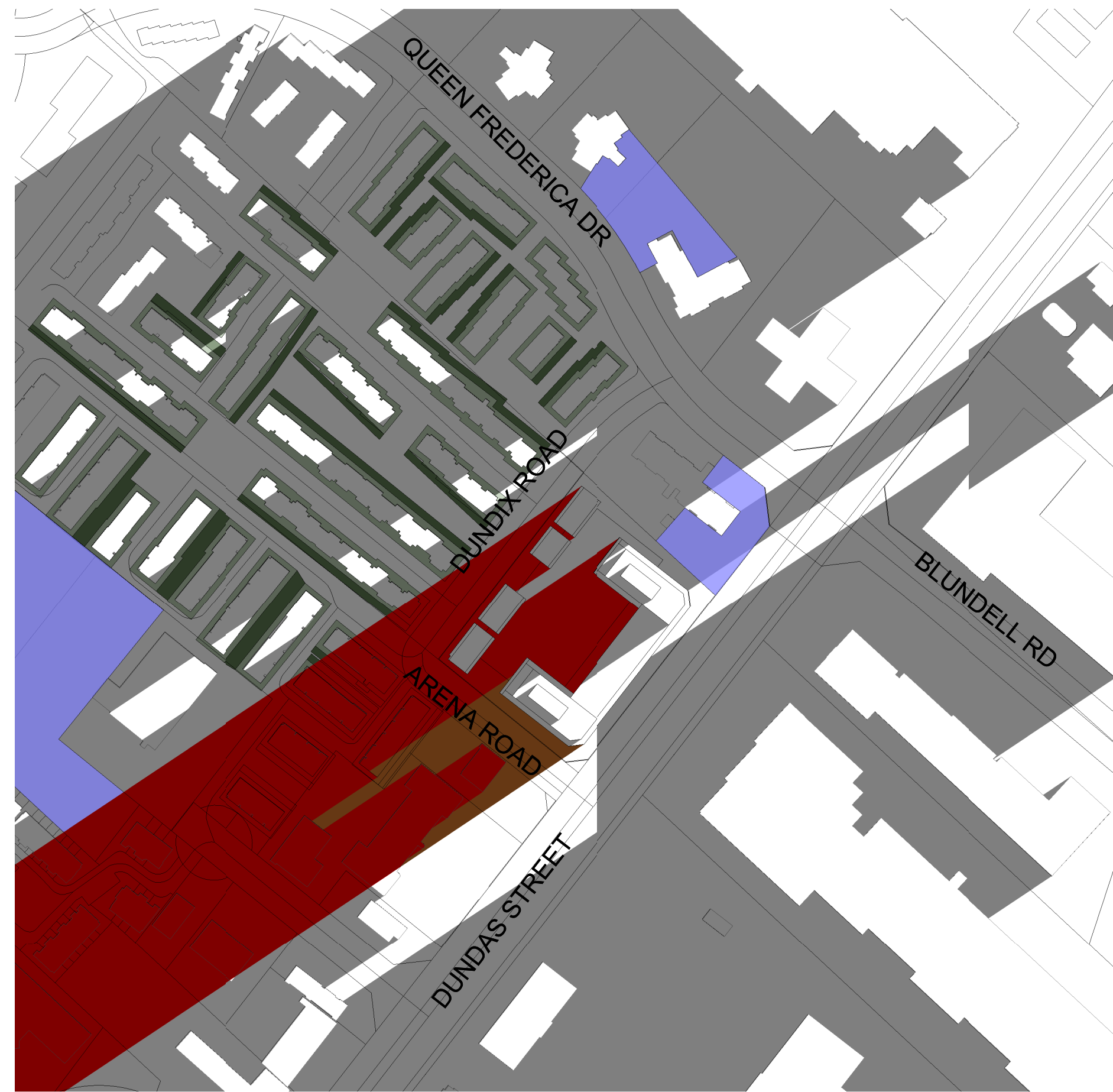
1 JUNE 21 - 0537 AM SPA817 1:2500