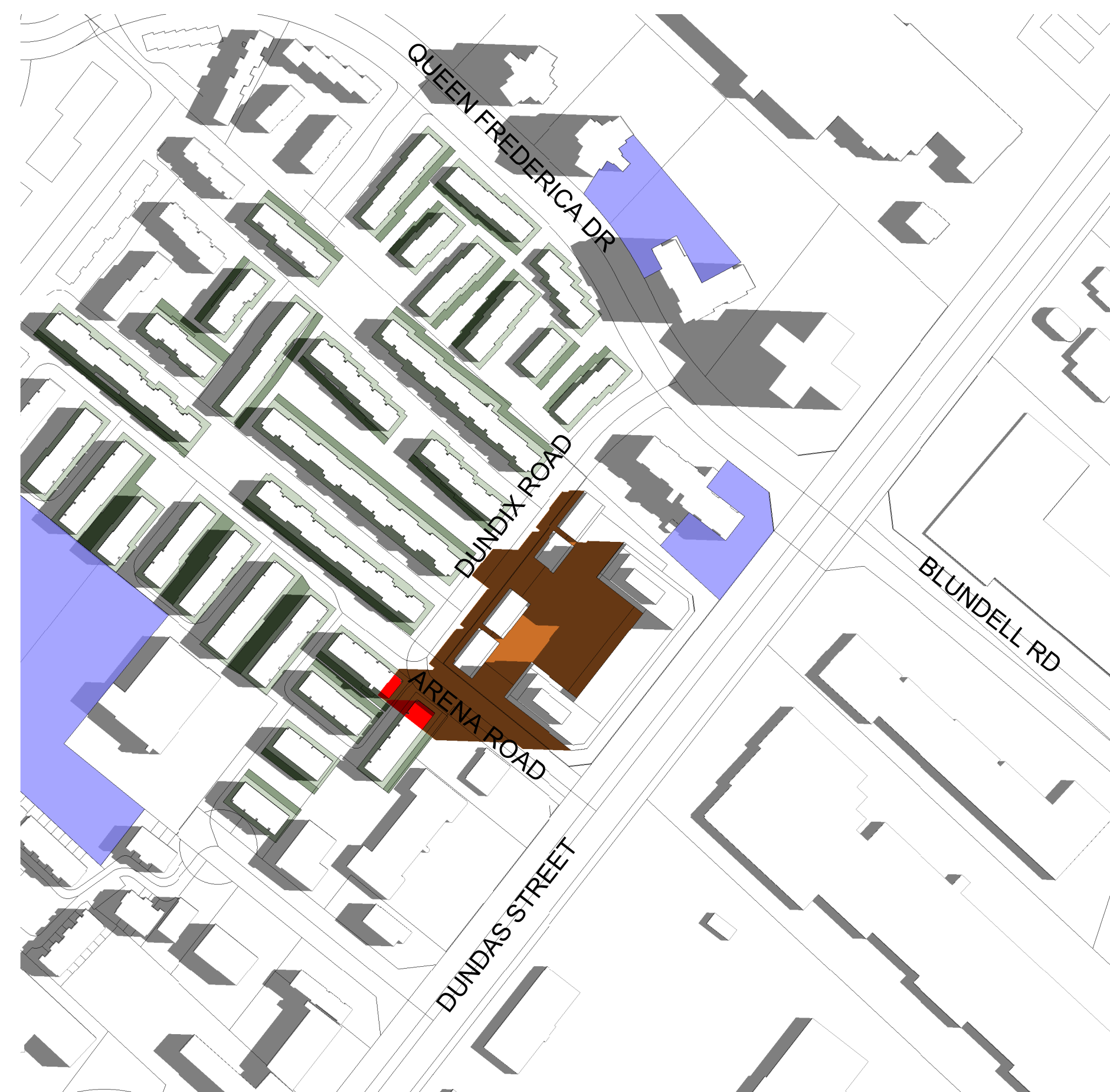
5 JUNE 21 - 0920 AM SPA817 1:2500