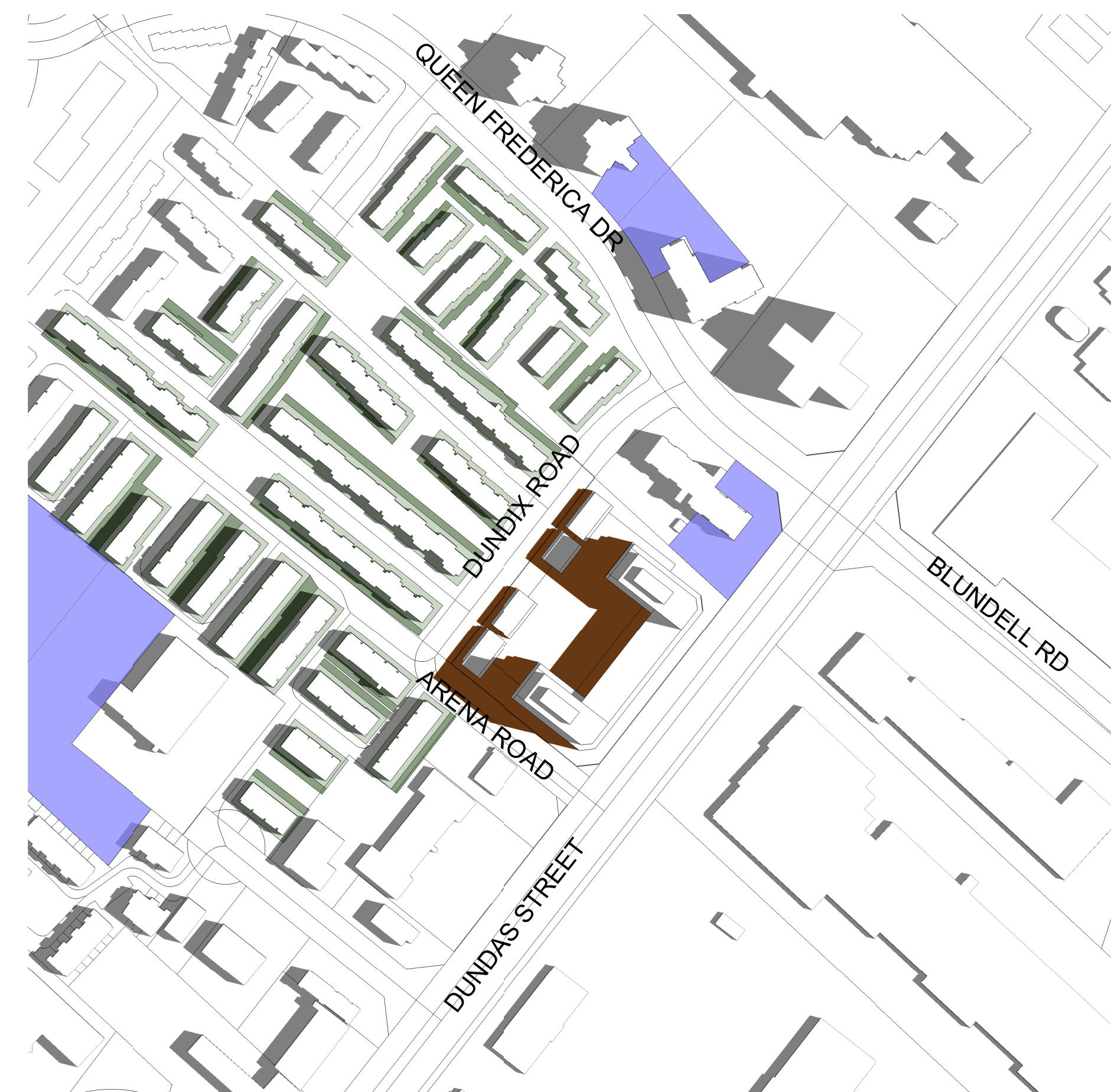
6 JUNE 21 - 1020 AM SPA817 1:2500