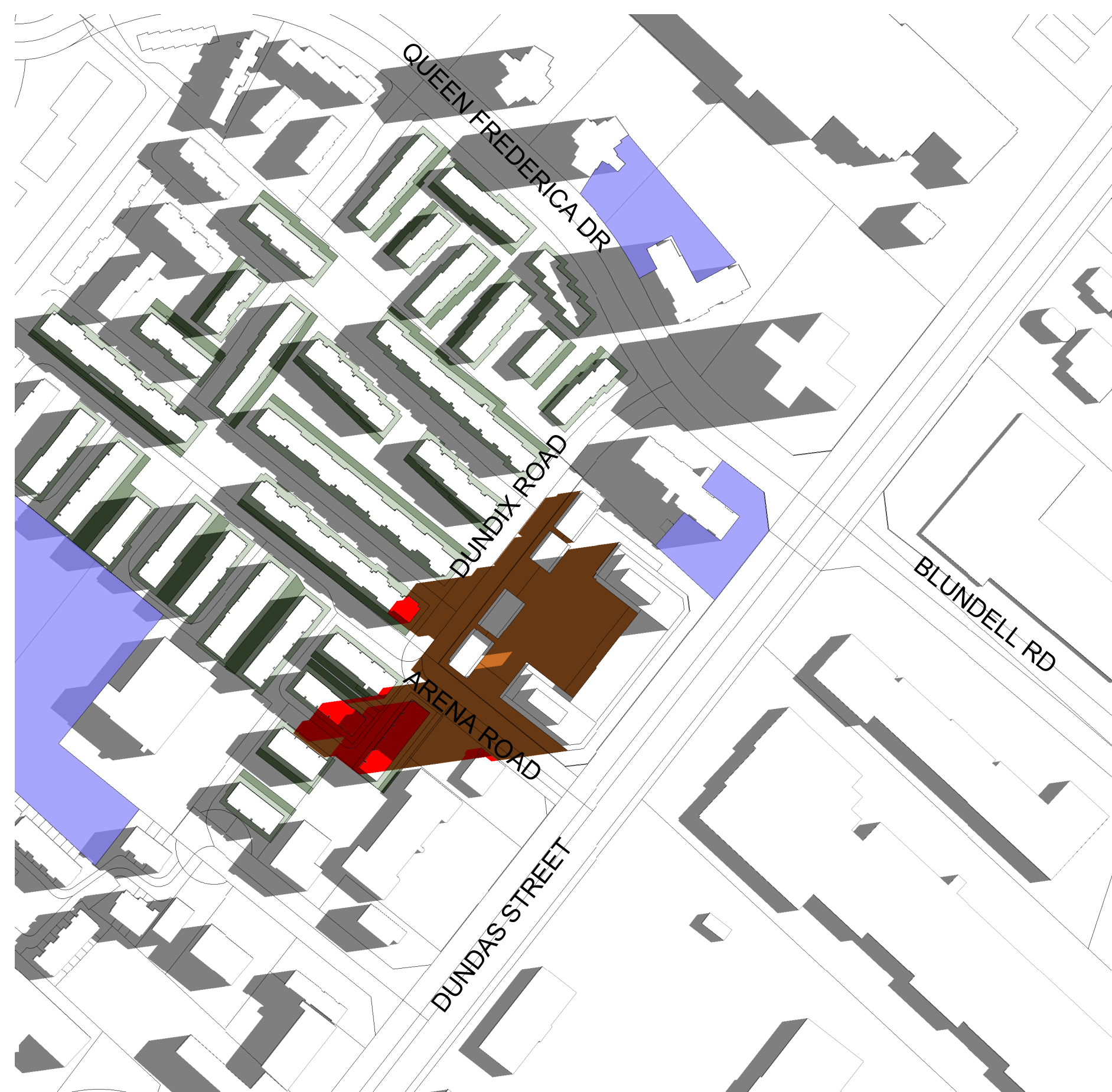
4 JUNE 21 - 0820 AM SPA817 1:2500