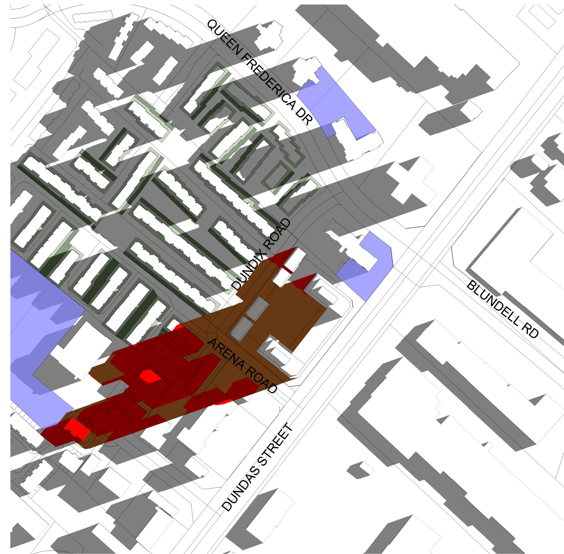
2 JUNE 21 - 0707 AM SPA817 1:2500