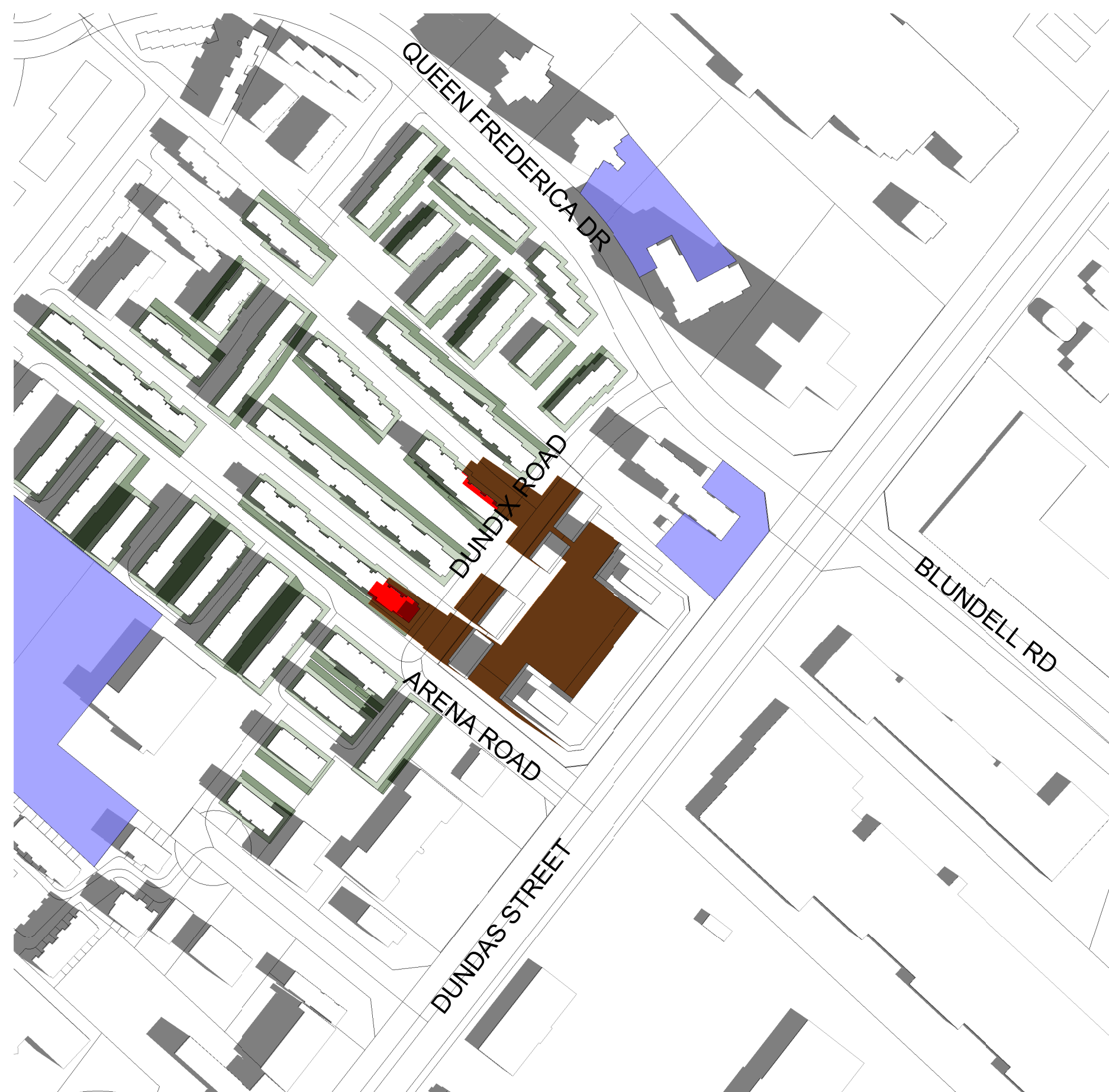
4 SEPTEMBER 21 - 1012 AM SPA814 1:2500