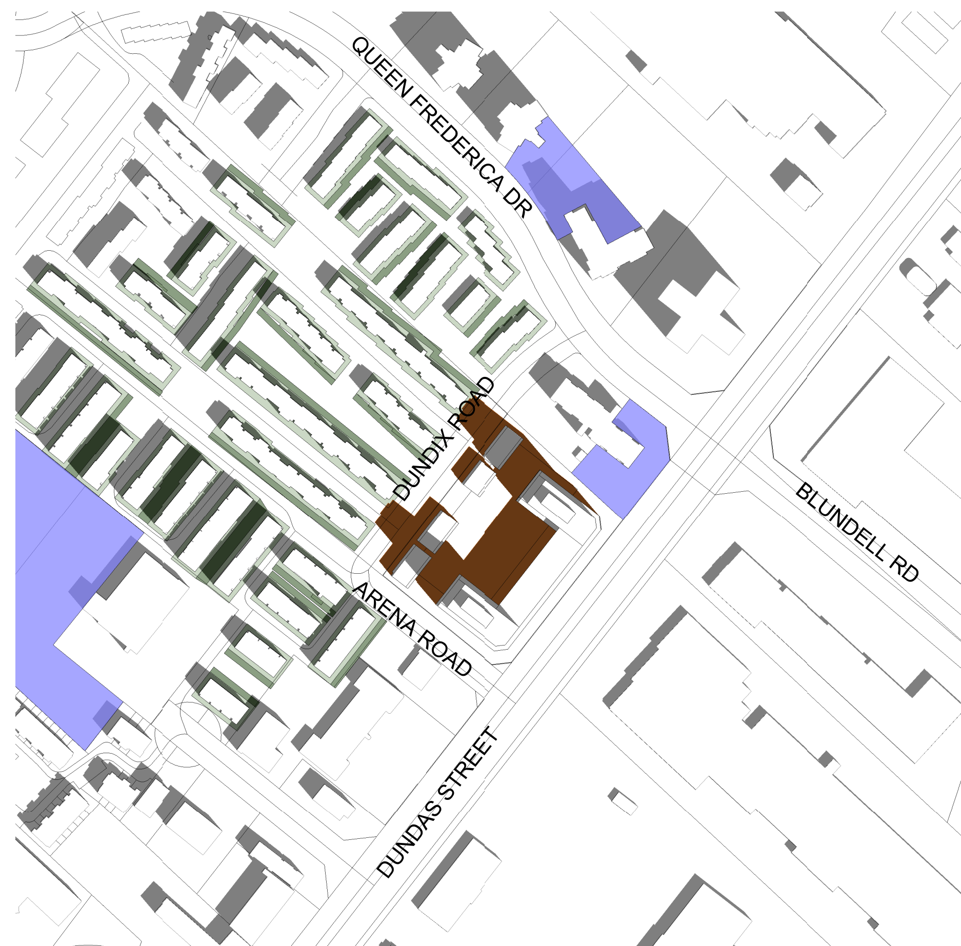
5 SEPTEMBER 21 - 1112 AM SPA814 1:2500