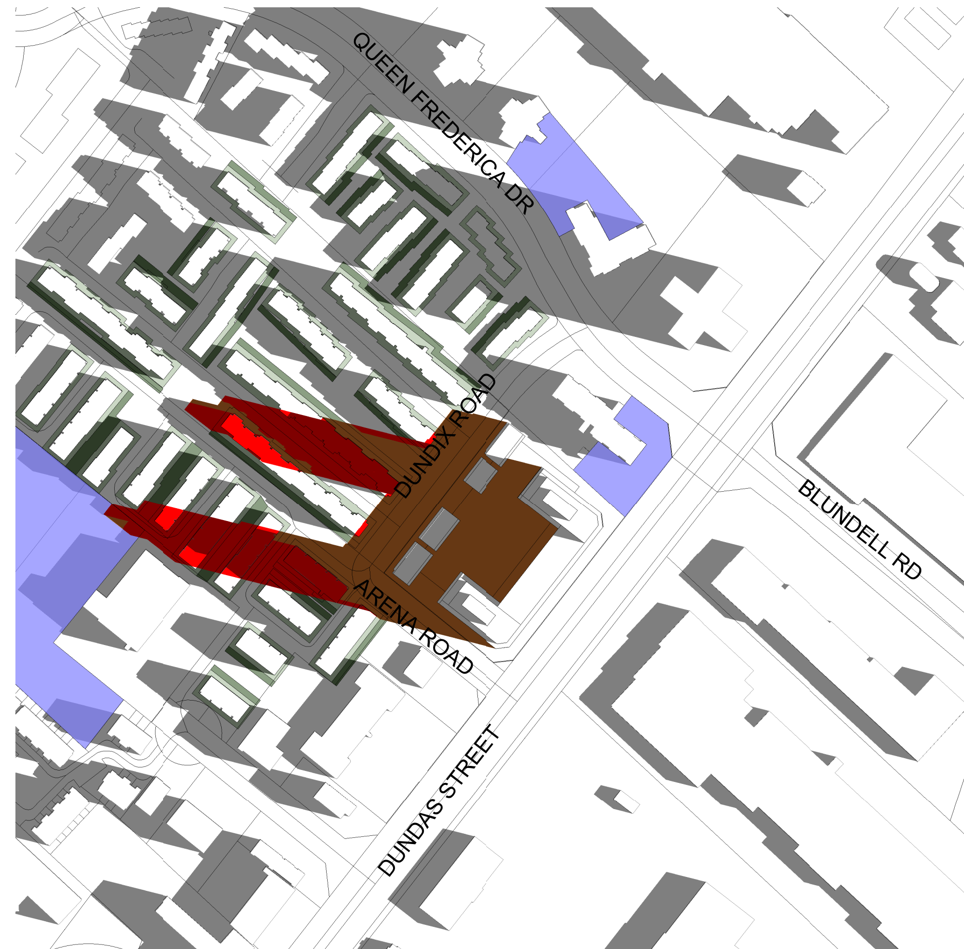
2 SEPTEMBER 21 - 0835 AM SPA814 1:2500