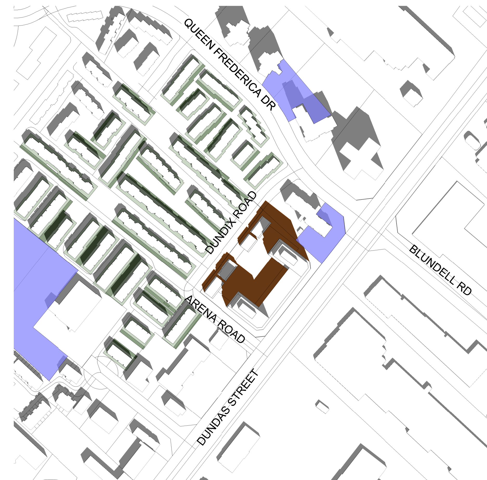
6 SEPTEMBER 21 - 1212 PM SPA814 1:2500