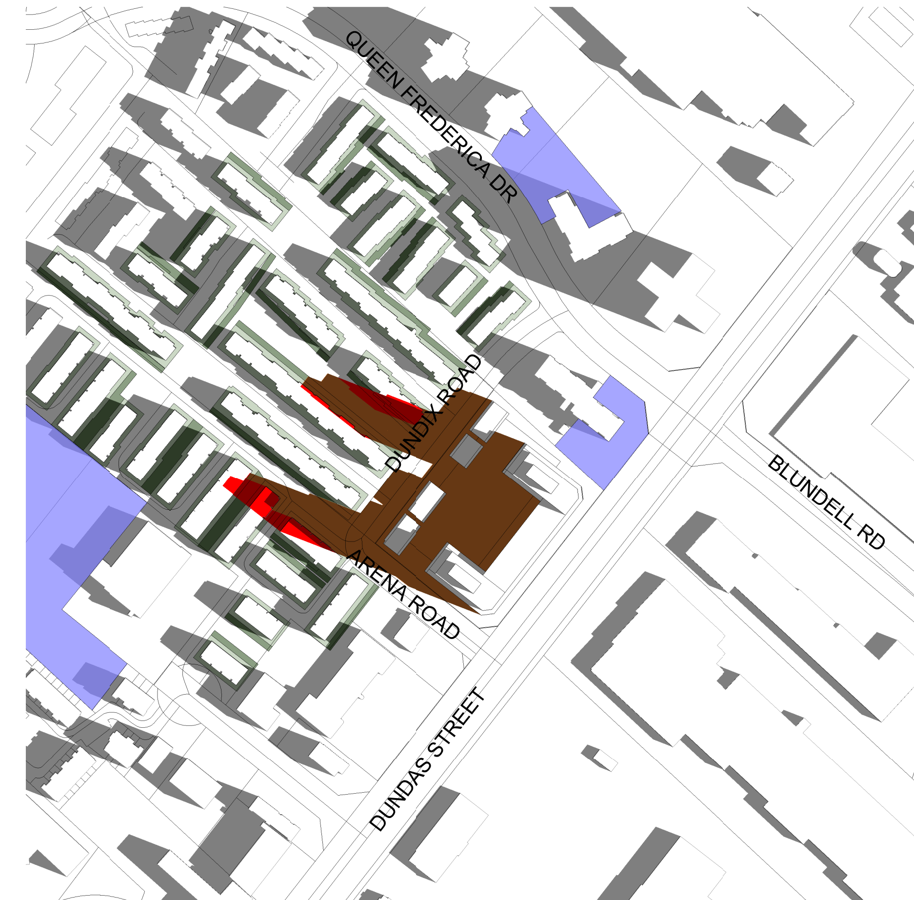
3 SEPTEMBER 21 - 0912 AM SPA814 1:2500