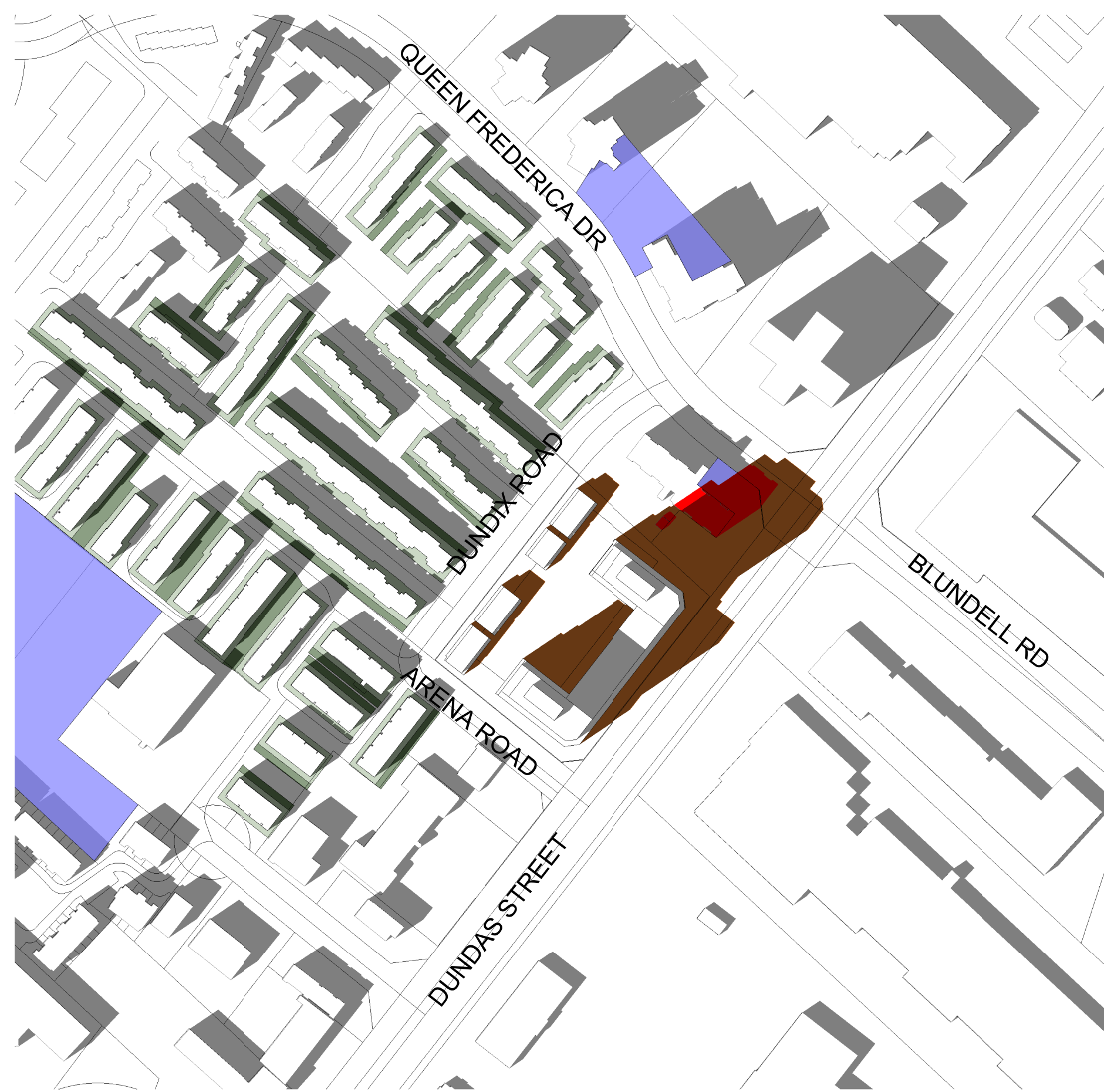
4 SEPTEMBER 21 - 1612 PM SPA815 1:2500