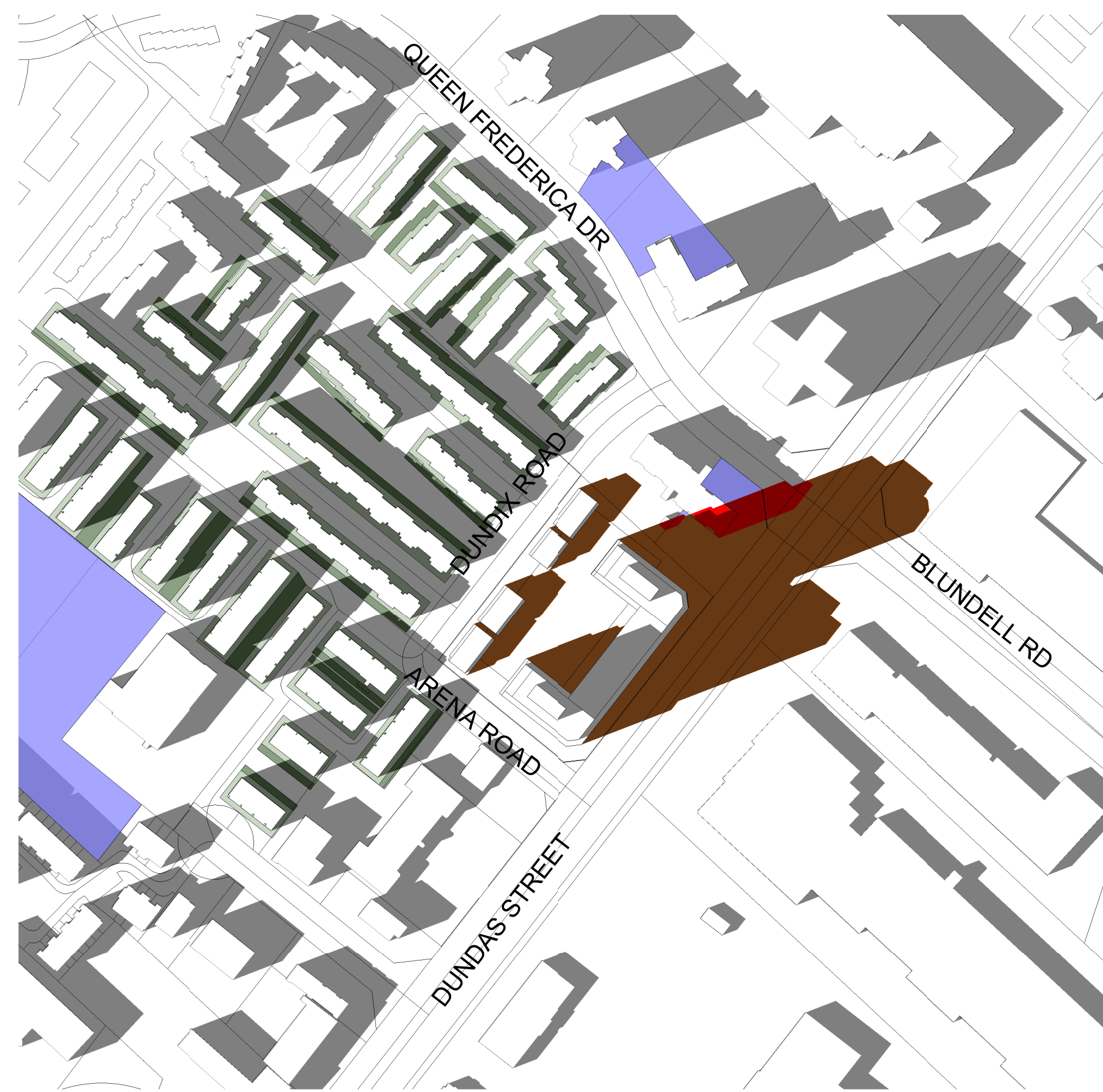
5 SEPTEMBER 21 - 1712 PM SPA815 1:2500