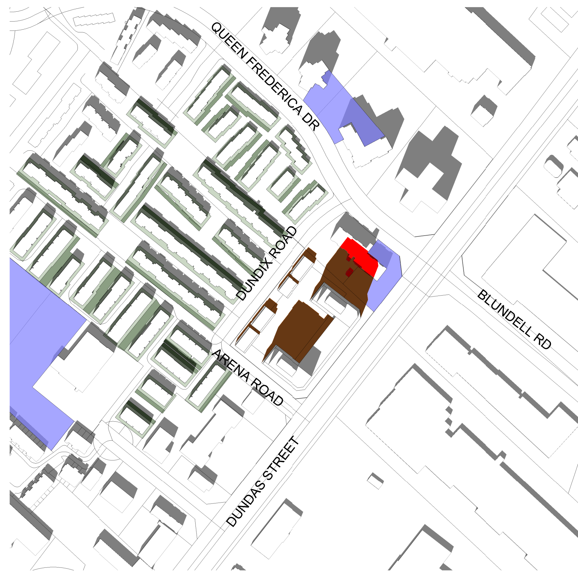
2 SEPTEMBER 21 - 1412 PM SPA815 1:2500