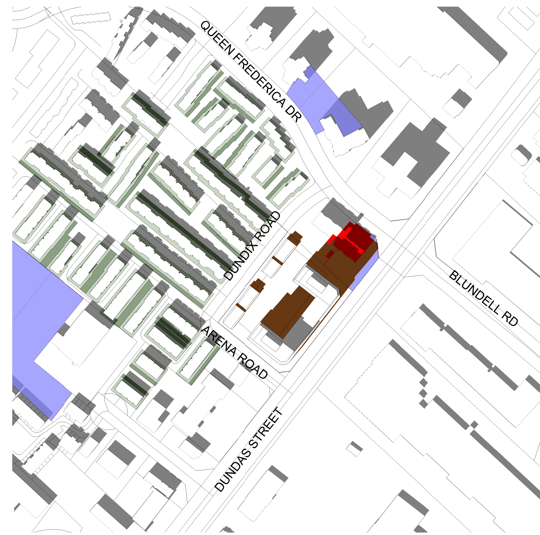
3 SEPTEMBER 21 - 1512 PM SPA815 1:2500