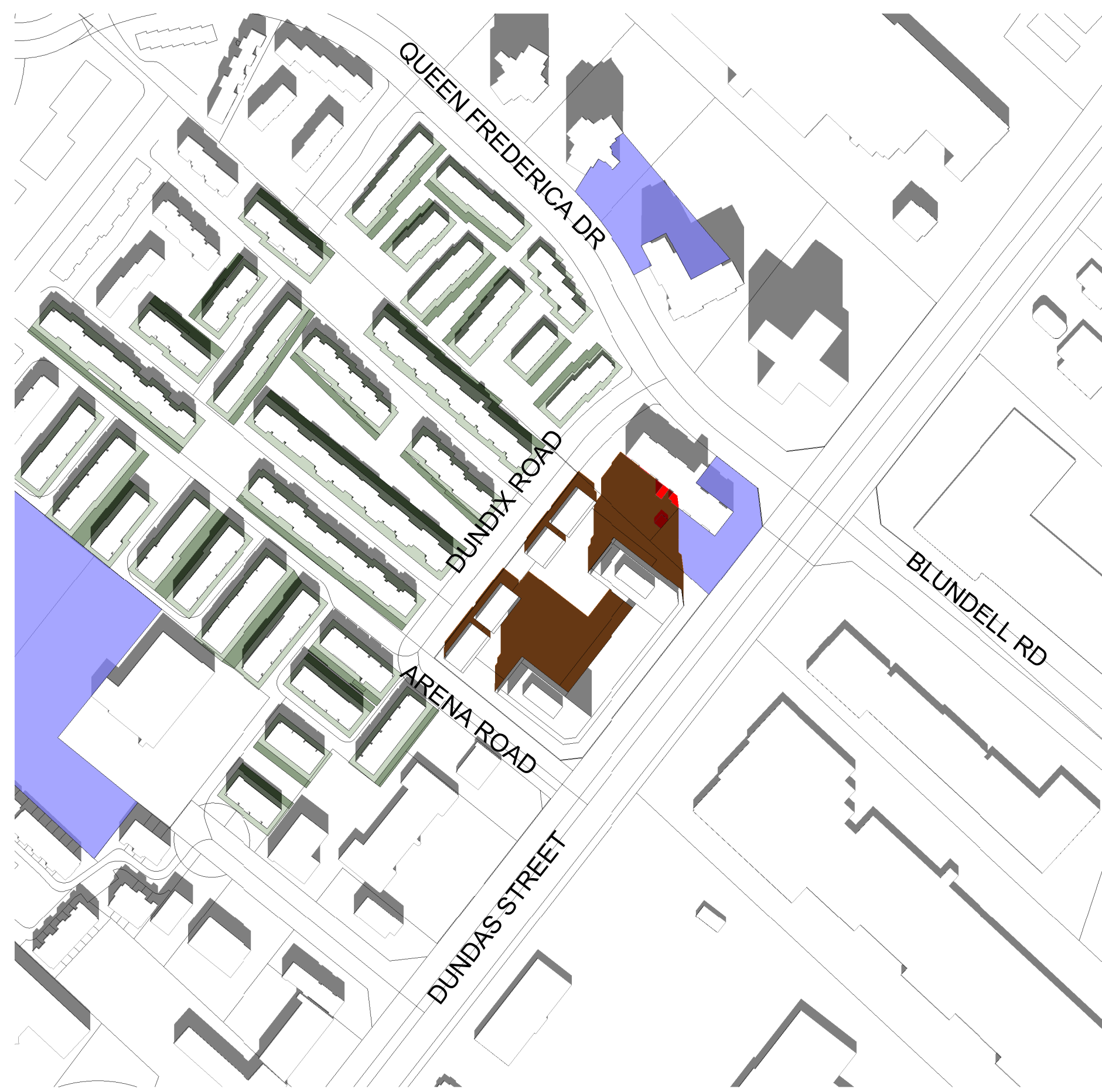
1 SEPTEMBER 21 - 1312 PM SPA815 1:2500