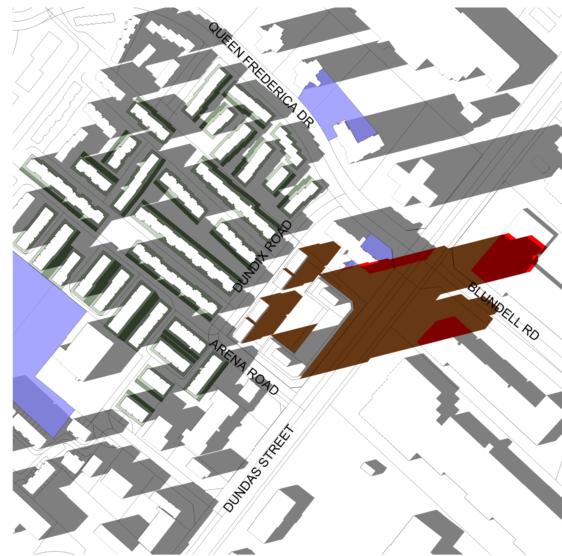
6 SEPTEMBER 21 - 1748 PM SPA815 1:2500