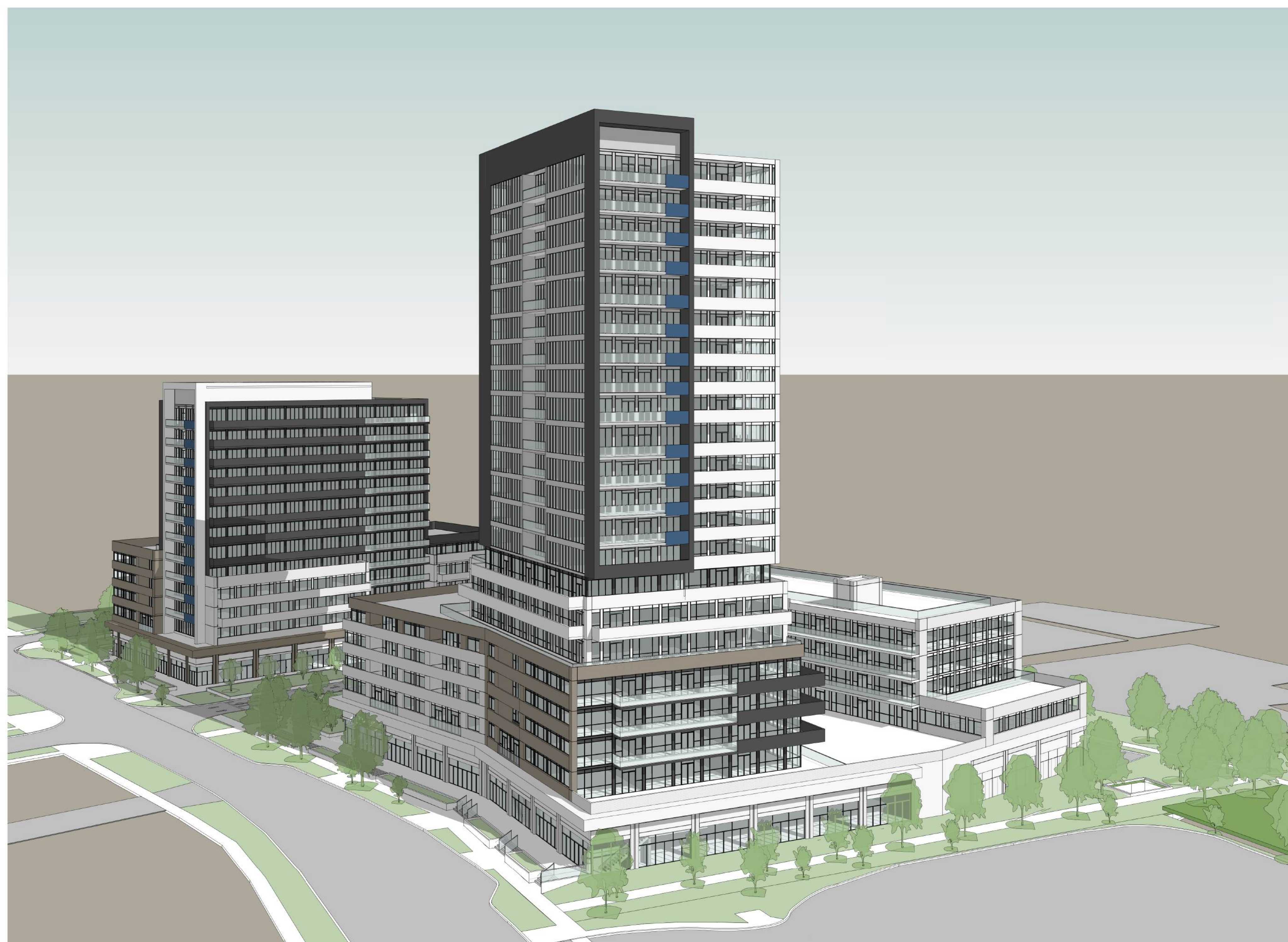
2 Perspective From Bloor A-036 NTS