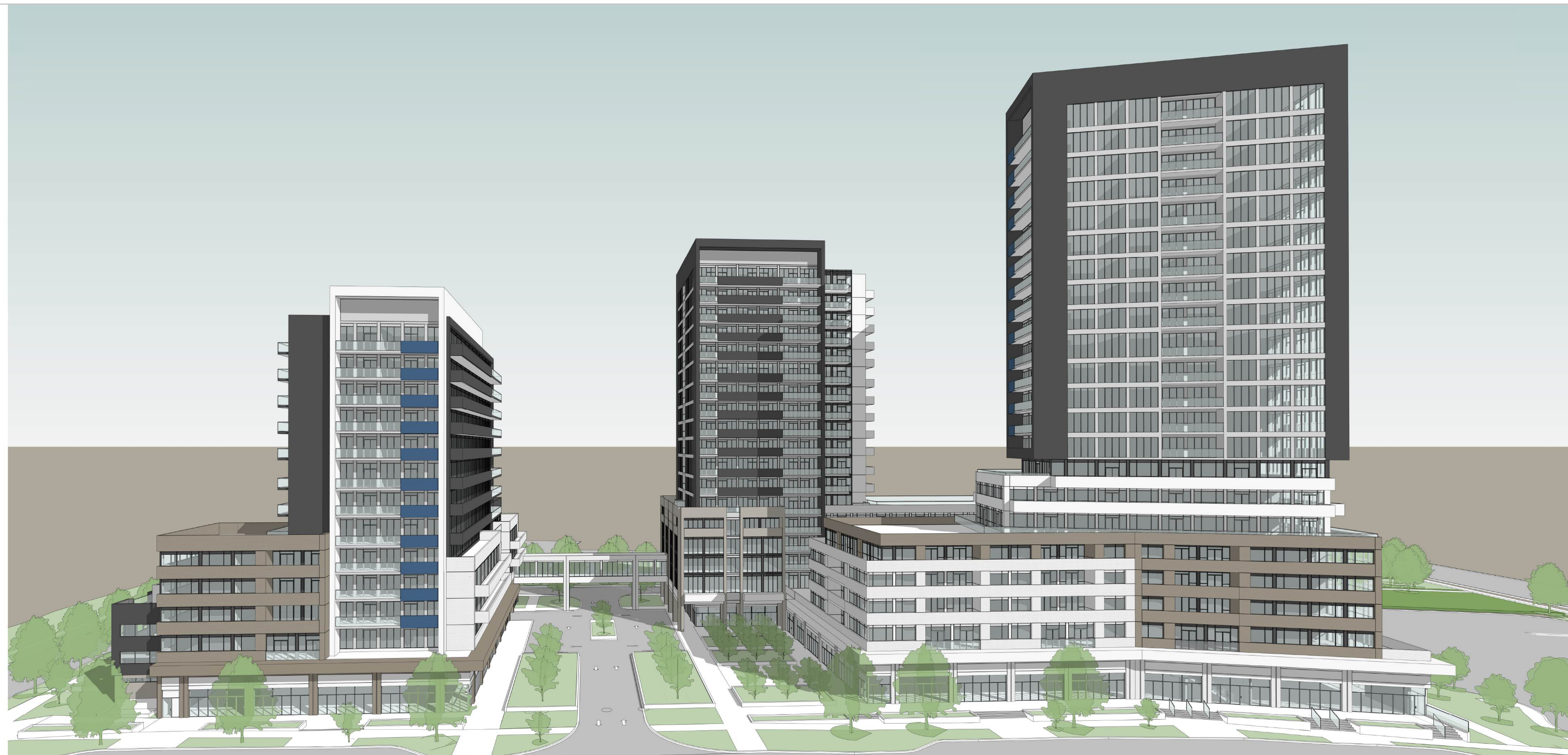
3 Perspective from Fieldgate A-036 NTS