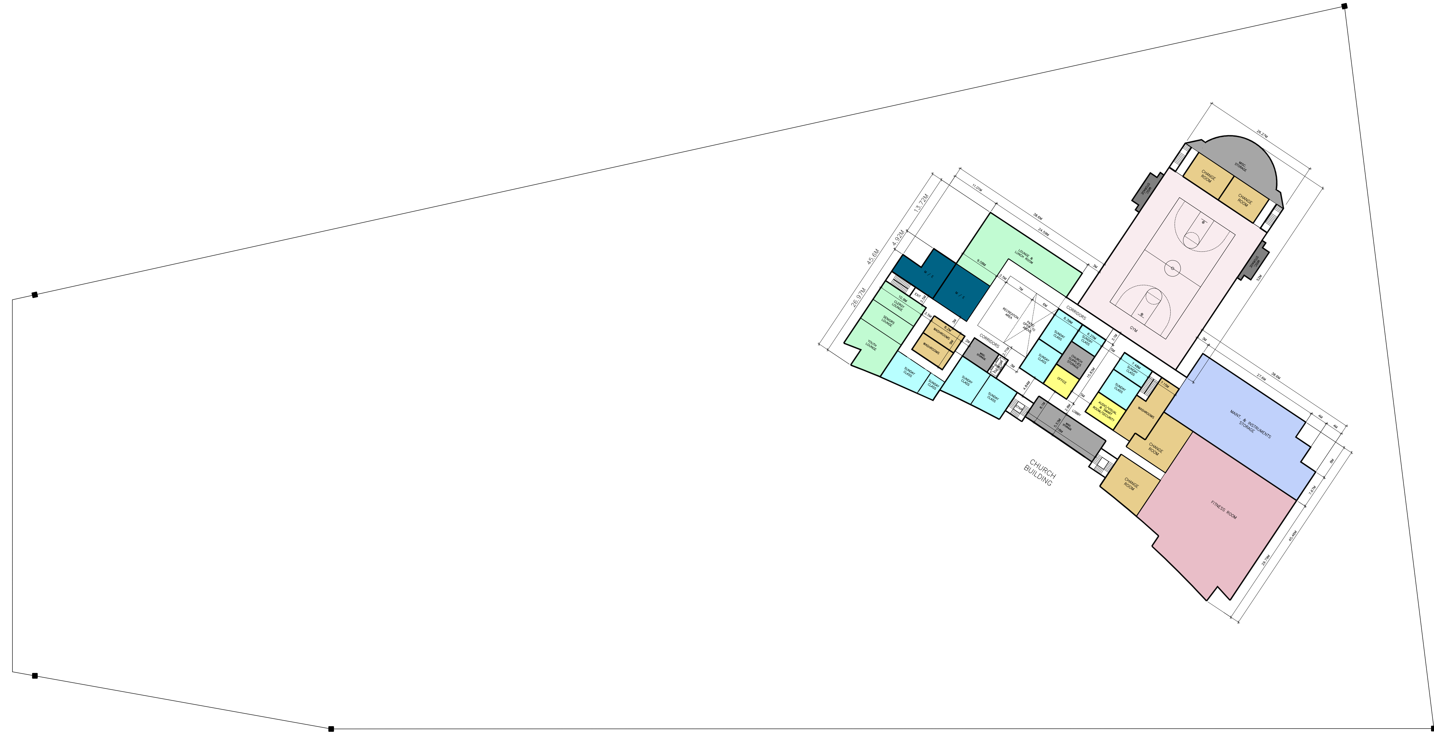
BASEMENT FLOOR PLAN SCALE : 1:500