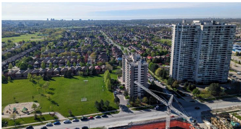
Aerial view of a Mississauga neighbourhood.