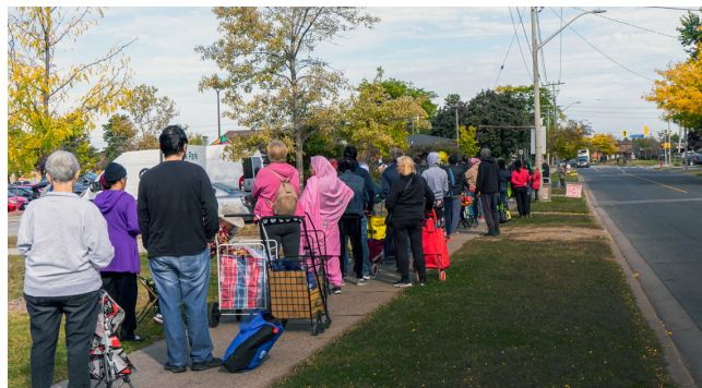
Line at Food Banks of Mississauga.

Recent data from Food Banks of Mississauga presentation, November 2024.