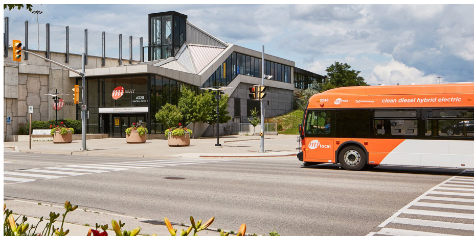
MiWay bus driving towards Central Parkway station in Mississauga.

2022 Report of Financial Accountability Office in Ontario