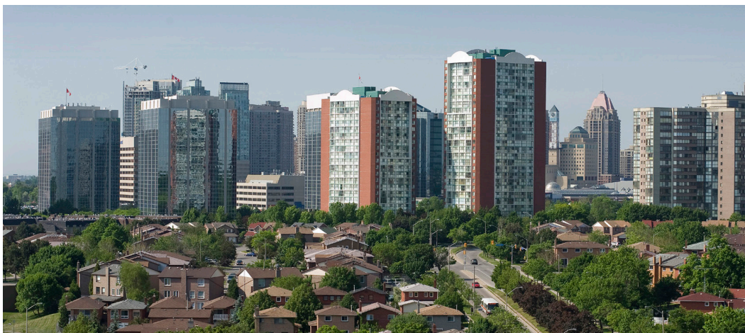
Mississauga needs more housing options for families, older adults, students and others who want to live in the city.