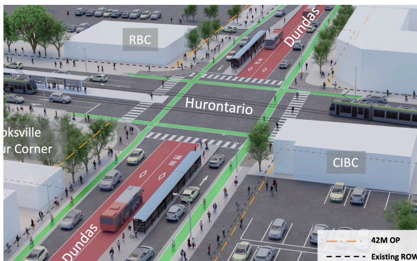
The Dundas BRT transit corridor will stretch 48km along Dundas Street, linking Mississauga, Hamilton & Etobicoke.