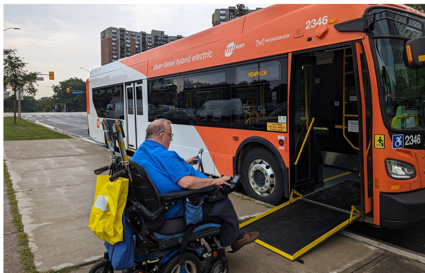
MiWay commuter in a wheelchair entering bus in Mississauga.

The Rt. Hon. Justin Trudeau, Prime Minister of Canada, Government of Canada