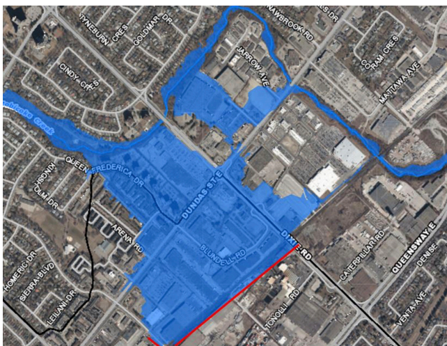
A floodplain map Dixie-Dundas area of Mississauga.

The Hon. Bill Blair, Former Minister of Public Safety and Emergency Preparedness, Government of Canada