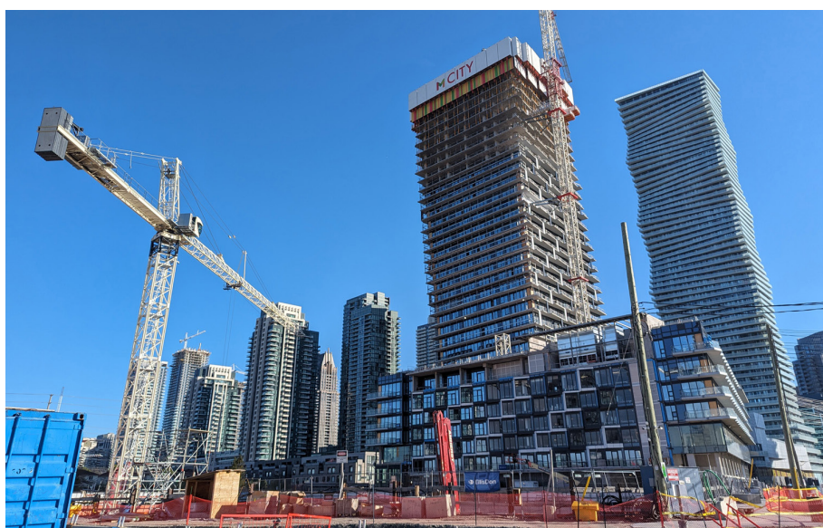
A condo building being constructed in Mississauga's downtown core.