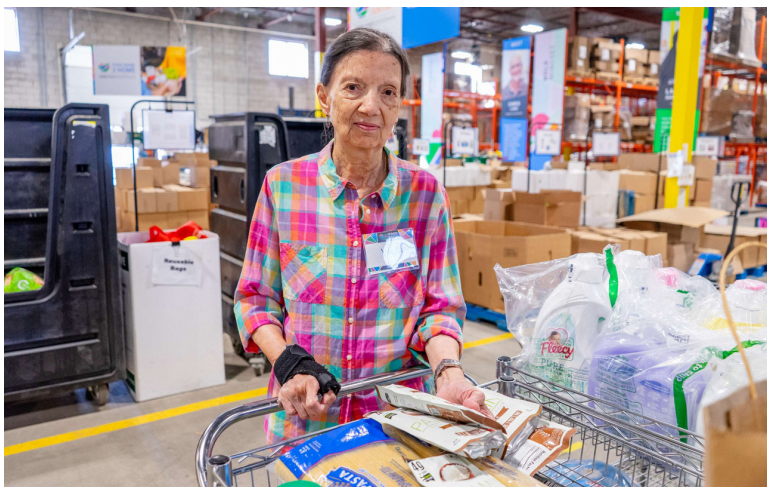
Volunteer at Food Banks Mississauga collecting food donations.