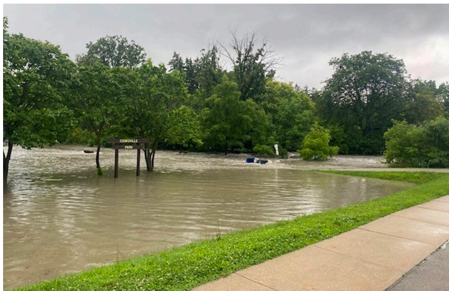
Cooksville Park flooded in Mississauga.

Report by MyChoice, a leading insurance comparison platform