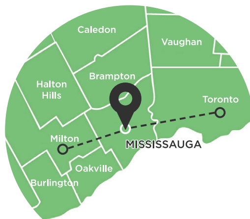
An image depicting a map of the all-day, two-way Milton GO Rail corridor line.

By 2041, the Milton corridor is expected to have up to 94,000 daily riders.