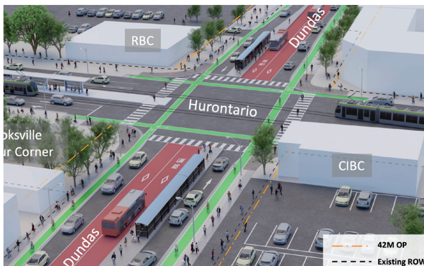
The Dundas BRT transit corridor will stretch 48km along Dundas Street, linking Mississauga, Hamilton & Etobicoke.