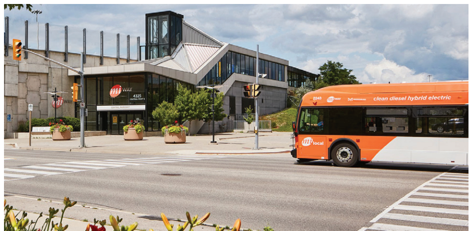
MiWay bus driving towards Central Parkway station in Mississauga.

2022 Report of Financial Accountability Office in Ontario