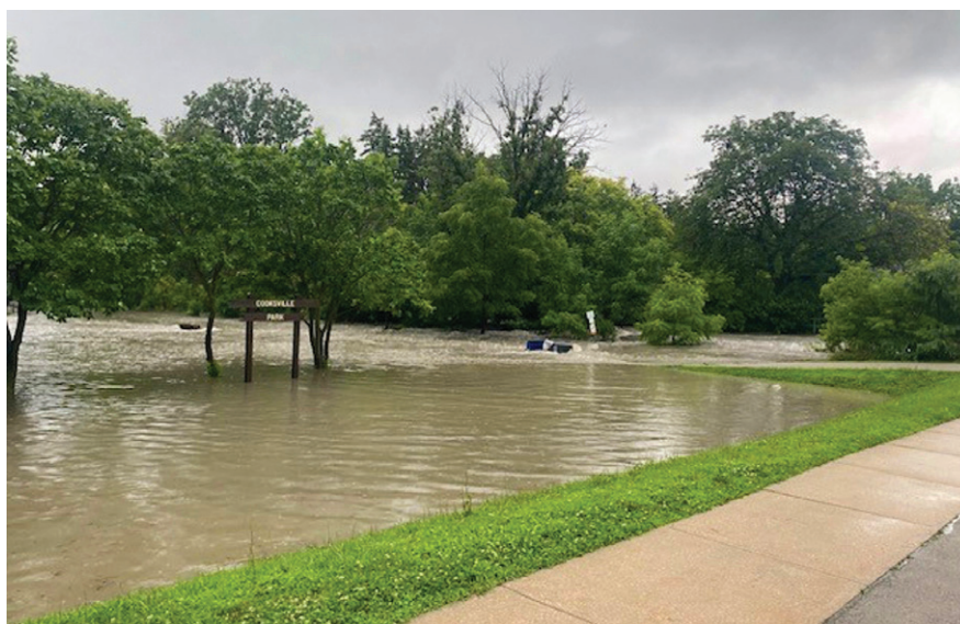
Cooksville Park flooded in Mississauga.

Report by MyChoice, a leading insurance comparison platform