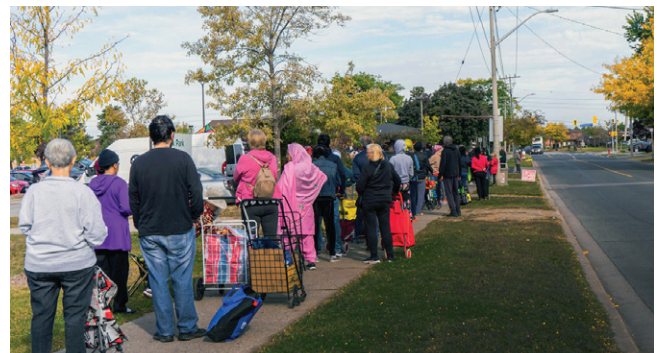
Line at Food Banks of Mississauga.

Recent data from Food Banks of Mississauga presentation, November 2024.