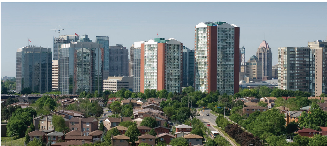
Mississauga needs more housing options for families, older adults, students and others who want to live in the city.

Iqwinder Gaheer, Member of Parliament for Mississauga – Malton, Government of Canada