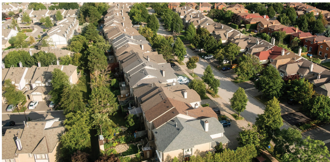
Rows of housing in Mississauga neighbourhood.

However, as our population continues to expand, Mississauga is facing increasing challenges in funding these vital services within an outdated municipal revenue framework. Designed in a different era, this framework does not meet the economic realities or the needs of a 21 st century city.