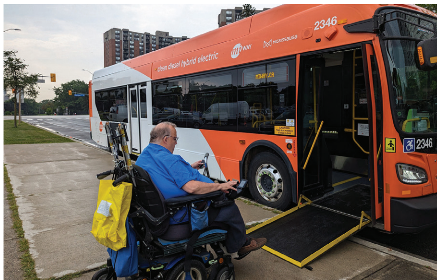
MiWay commuter in a wheelchair entering bus in Mississauga.

The Rt. Hon. Justin Trudeau, Prime Minister of Canada, Government of Canada