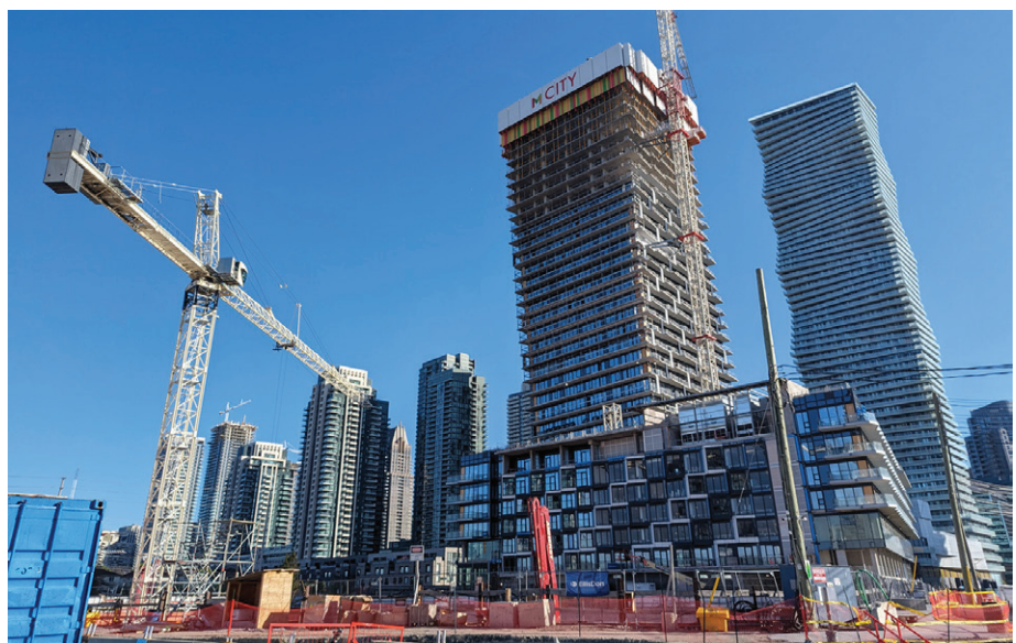
A condo building being constructed in Mississauga's downtown core.