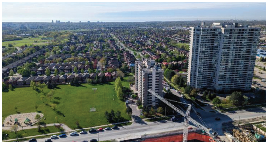
Aerial view of a Mississauga neighbourhood.