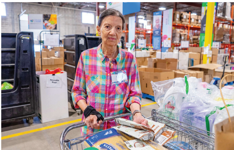
Volunteer at Food Banks Mississauga collecting food donations.