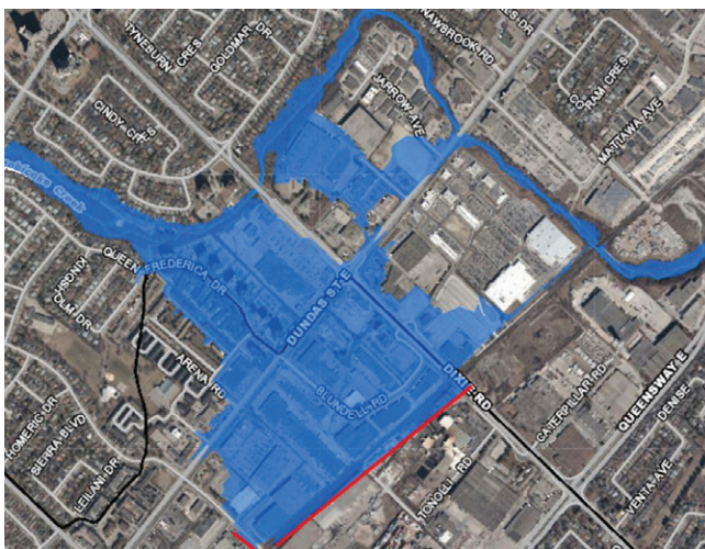
A floodplain map Dixie-Dundas area of Mississauga.

The Hon. Bill Blair, Former Minister of Public Safety and Emergency Preparedness, Government of Canada