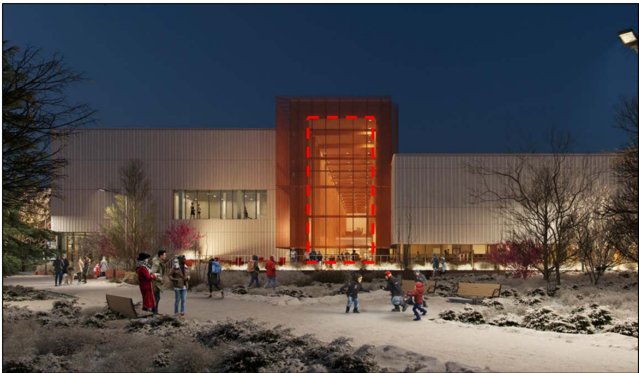
Figure 4. This rendering shows the view from South Millway at night. At night, the public art will be visible through the curtain wall glass and architectural screen, to those outside in the park.