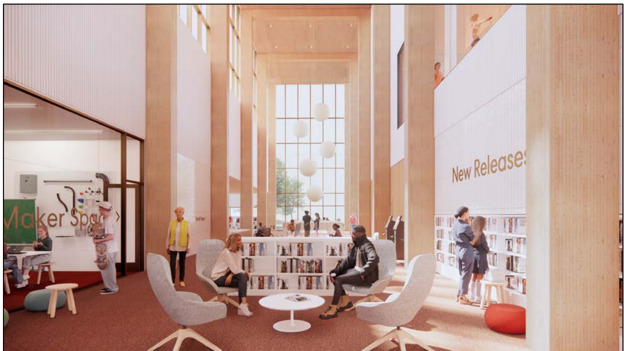
Figure 1. In Perkins & Will Architects’ rendering of the proposed redeveloped library, the new public art will take the place of the hanging white baubles in front of the large window.

The City of Mississauga (the “City”) seeks to commission a professional artist or artist team to create a hanging indoor sculptural installation as part of the redevelopment of South Common Community Centre and Library that reflects the themes of eco-social sustainability and cross-cultural and intergenerational communities.