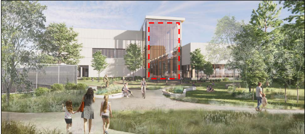
Figure 3. This early architectural rendering shows the view from South Millway. The public art will be located behind the large curtain wall glass and architectural screen (not shown) facing the park.