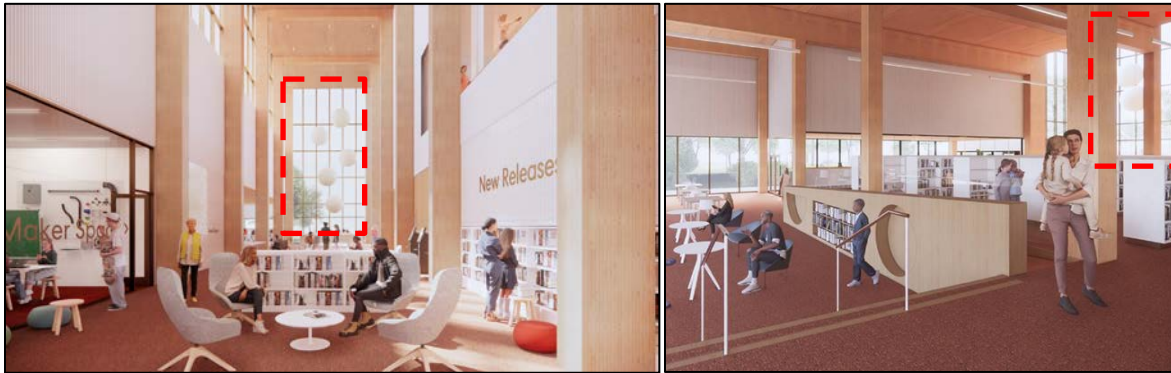
Figure 5. The public art will be a hanging interior sculpture, in front of the Library window and architectural screen (not shown) facing South Millway. It will be visible from multiple areas inside the Library.