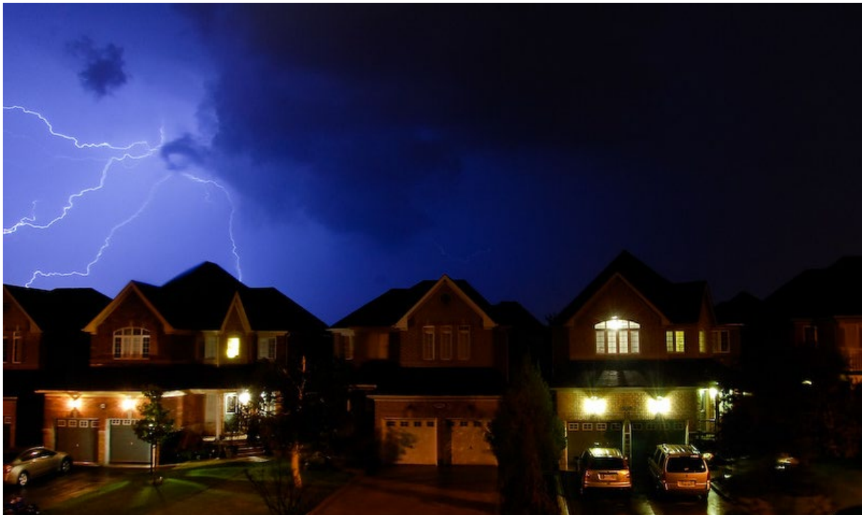
Mississauga storm; photo by Shabbir Siraj

The City's public art program is seeking a contemporary artist for a public art residency with the City's stormwater projects team.