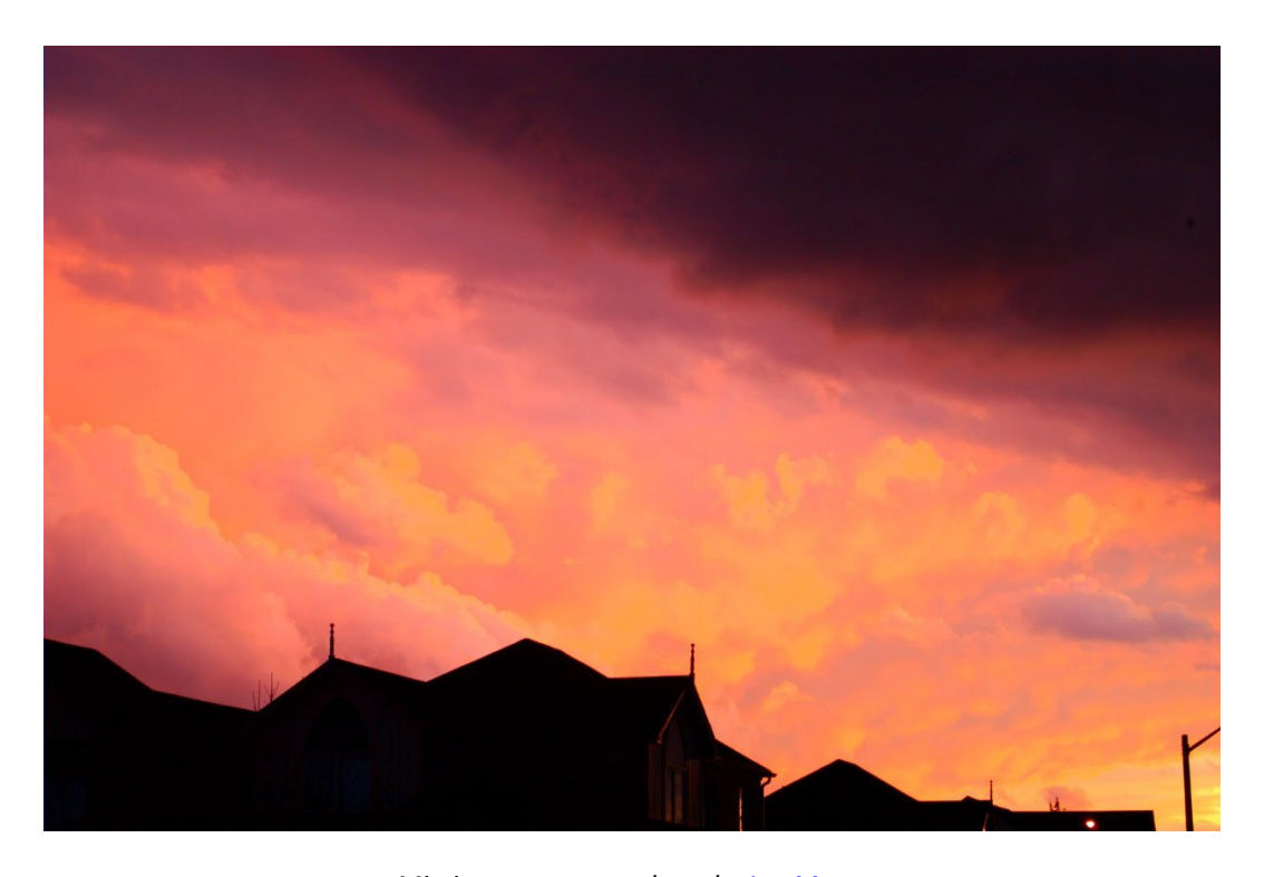
Mississauga storm; photo by <u>lan Mutto</u>