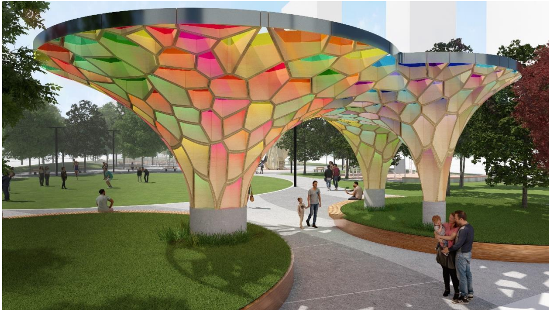
Proposed artwork for Park 540, “Zaagaasige”, view from the east.

About the Artwork: Inspired by the Ojibwe word “Zaagaasige”, the sun shines between and out of, the selected proposal is a sculptural canopy created by an organic cellular structure of structural wood that filters sunlight into a landscape of color below. The lily pad-like canopy creates a gateway for the park and a new horizon giving visitors the sense that they are immersed in a magical atmosphere created from light and color.