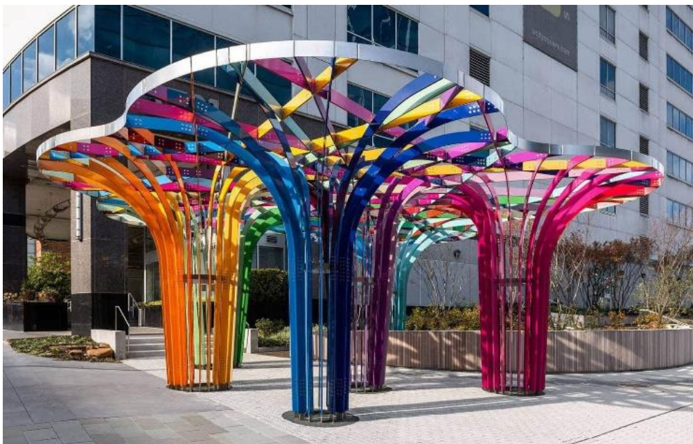
Spectral Grove, SOFTlab, 2019. Philadelphia, PA.

As part of this public art project, the City, together with SOFTlab (“Mentor Artist”), is offering a paid public art mentorship opportunity, for artists with an interest in gaining knowledge and experience in designing site specific public art, planning for public art projects, and the associated fabrication, coordination and installation process. The successful candidate will be mentored by SOFTlab.