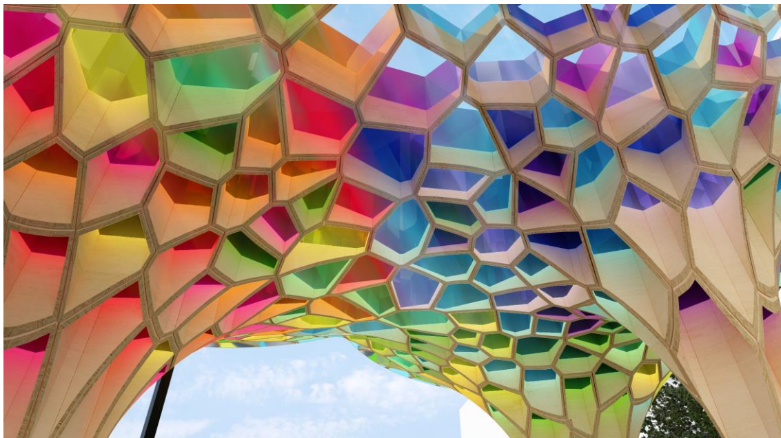
View from below the canopy of Zaagaasige.