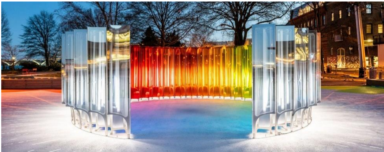
Mirror Mirror, SOFTlab, 2019. Alexandria, VA.

**The City defines a mid-career artist as an artist who has been actively creating and exhibiting work for at least 7 or more years. This artist exhibits more regionally to where they are located and has built up a larger body of work.